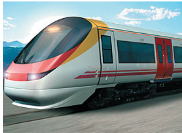
FIG 005 Proposed Gautrain with route alignment map

As the first underground public transport system in South-Africa, the Gautrain poses many design challenges and opportunities; one such being the transition from road transport to that of underground rapid rail transport. From Harding’s (2001:56) article about the new Singapore rapid transit station, it is understood that likewise, the South African public will in all probability be in favour of such a transition when the alternative of public transport is perceived as a proficient system that offers many advantages to its users. The novelty can be used to learn from the past. The history and evolution of the metro offers the opportunity to make well informed decisions, avoid past mistakes and simultaneously continue with methods that achieved superbly designed spaces.