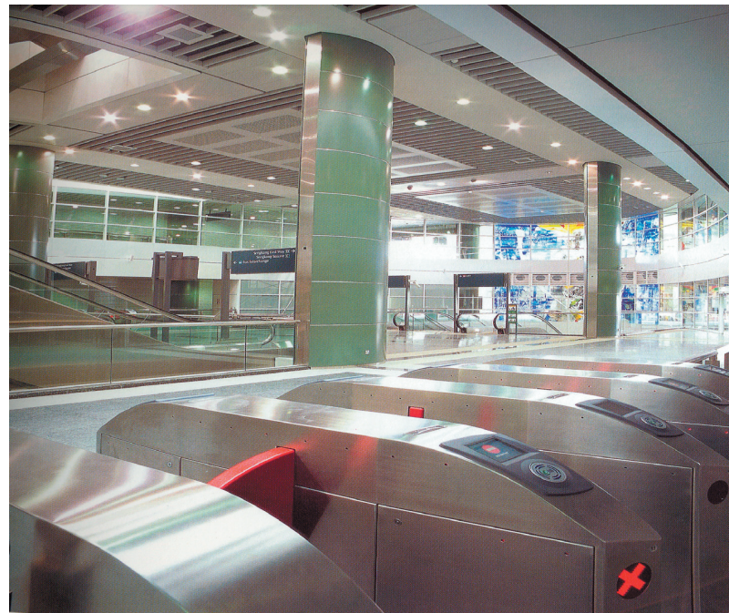
FIG 006 Sengkang station, North east line Singapore

The Subterranean Space dissertation will concentrate on the design and development of the relationships between the various components of the Gautrain Sandton underground station. Focus will be on the integration of commercial and supplementary spaces within the larger identity and structure of the transportation hub, and on aspects that will promote the comfort and clarity of the commuter experience.