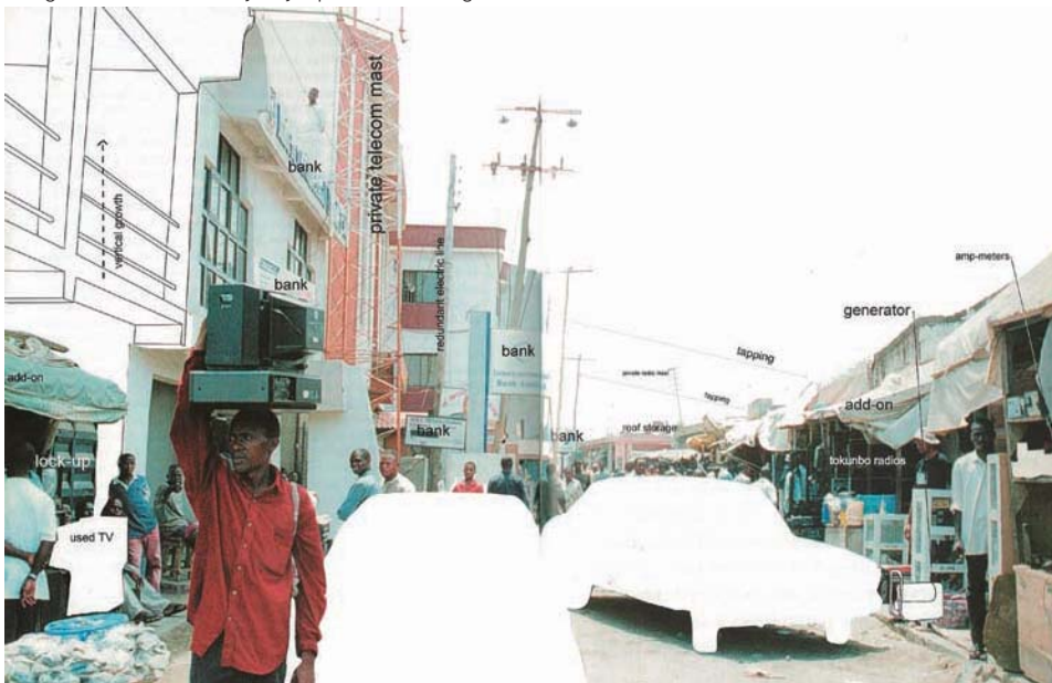
fig. 1.2 Praxis of quotidian context [public space]

The project thus aims to both celebrate and enhance the quotidian context of the city, through the development of a responsive spatial typology and exploring the concept of liminal public infrastructure. The dissertation promotes the understanding of everyday activities as part of the urban environment; not in opposition to it. This encompasses the spatial identity of the city, where the design aims to uplift the urban context by providing a stage for these everyday spectacles (fig. 1.2).