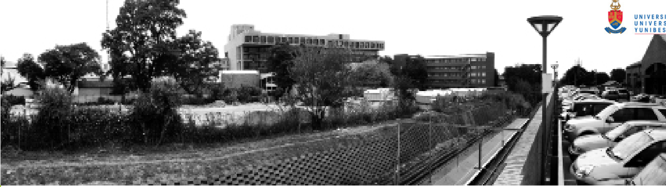
FIG 1.2_View from Rissik Station towards chosen site

From these key driving forces, various deliverables have also been stated. These deliverables provide the foundation from which appropriate design responses can be generated: