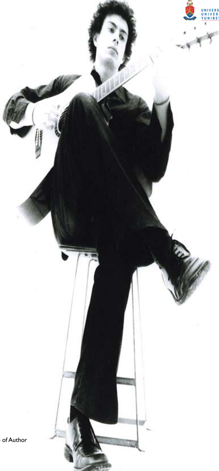
FIG 1.5_Photo of Author