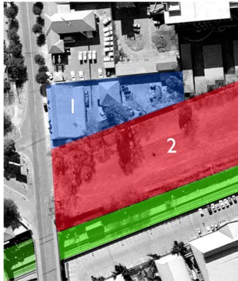
FIG 1.4 _Property ownership involved framework implementation

The strength of the joint venture lies in the fact that the private sector works with the Tshwane municipality to not only gain returns on investment in built interventions, but also provide an enriched urban realm that can be enjoyed by all. This approach will yield a far greater return on investment and longevity for these new interventions. By creating the activity spine, Intersite establishes its existing movement routes as primary activity sectors. A constant influx of users will provide not only vital arrival and departure points, but also destination places for users to linger and enjoy. The proposed scheme ultimately sets an important precedent for the effective rejuvenation of lost space adjacent to train tracks. City Properties gains a much needed spill out space for its occupants, with the added advantage of being centrally located for major movement and activity zones, the urban green corridor and the University of Pretoria, ultimately increasing the popularity of the overall development.