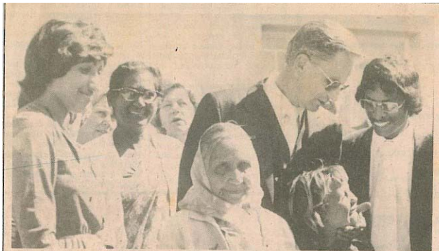
Indian guests with their hosts of the Hendrina NGK yesterday. The Indians are from the Reformed Church, Durban, an NGK sister church.