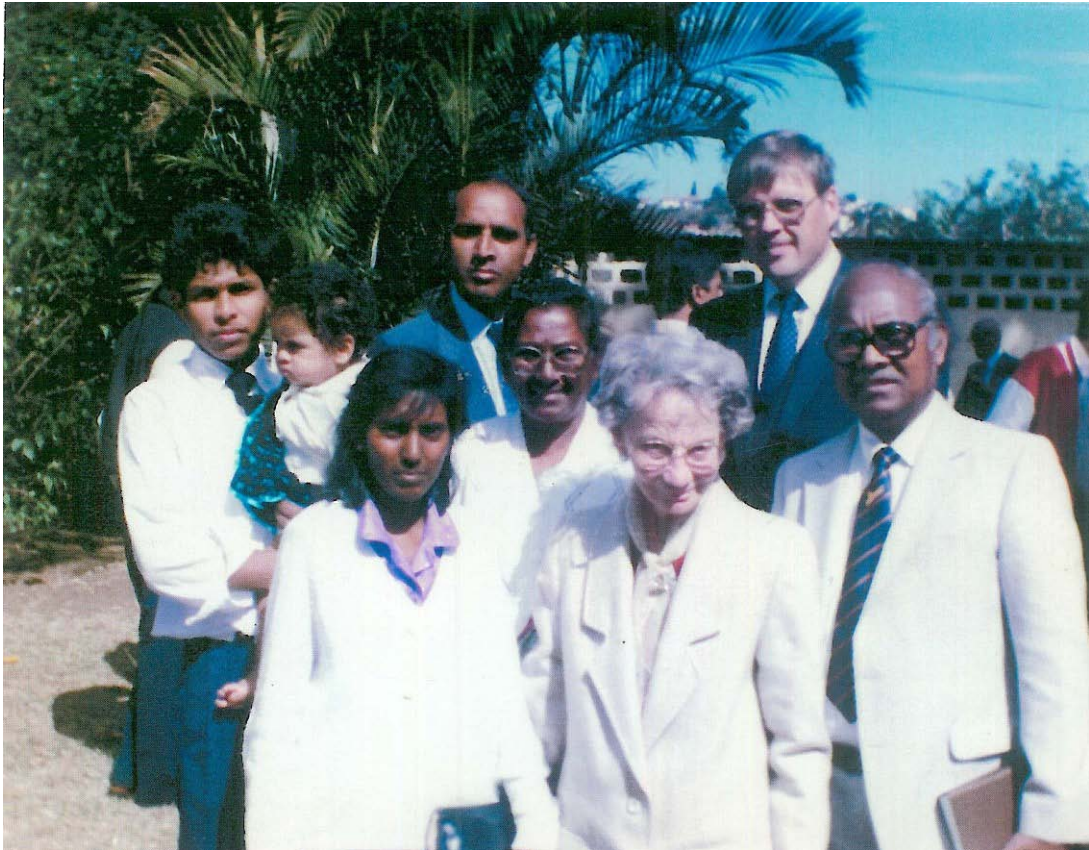
Church leaders of the Jeshurun Congregation

On one occasion, during the Pentecost week, I was conducting a service at the church in Avoca. A white lady in a sari belonging to the Hare Krishna movement, attended. I experienced the service as one of the most difficult meetings. I felt that I was preaching against a wall. After the service we prayed for her and took her back to the Hare Krishna Centre. Later we received a letter from her, thanking us for the hospitality and sharing with us that she had found Christ!