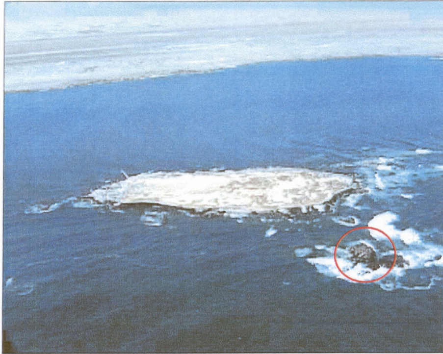
Figure 1.2. Aerial photograph of Ichaboe Island, showing the proximity of the island to the mainland (c. 1.4 km) and the position of the seal colony at Little Ichaboe (red circle), which lies 200 m south-west of the island. The picture is orientated with north to the left.

The Cape fur seal ( Arctocephalus pusillus pusillus , Otariidae; Harrison & King, 1980; Shaughnessy 1979) is the only indigenous breeding pinniped in southern Africa, and is sexually dimorphic for size (Shaughnessy 1985). It breeds at 24 colonies between Cape Cross in Namibia and Algoa Bay in South Africa, with 65% of the population occurring in Namibia (David 1987; Miller, Oosthuizen & Wickens 1996). Population numbers of Cape fur seals have increased since their over-exploitation in the early 1900s (Shaughnessy 1985) and numbered about 1.5-2 million