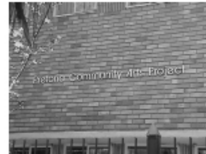
2 Stretcher bond - Childrens Art Centre