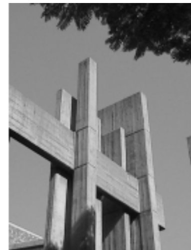
1 Off shutter concrete structure, defining the Entrance - Doxa Deo

Glass gives the ideal opportunity to introduce natural light into the building, merging interior and exterior into one scene. Through using shading devices, keeping in mind the orientation of the facade, can eliminate most disadvantages associated with glass.