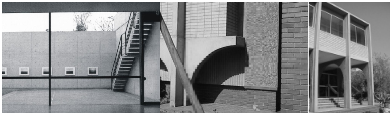
1 Naoshima Contemporary Art Museum - Tadao Ando