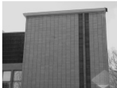
1 Stack bond - Lutheran Church

The use of brick in stack bond will establish a relationship with the Lutheran Church and Doxa Deo, but contrats in relation to the Unisa Little Theatre. Brick and mortar construction is labour intensive, cheap and empowers people through use of local labour.