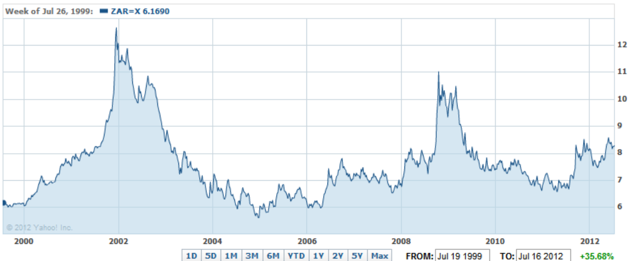
Graph 3: USD/ZAR Historical spot price

United States of America (US) managed hedge fund registered in the Cayman Islands could go long on EUR/ZAR futures where net settlement takes place in British Pounds (GBP) through a German bank. This transaction would to some degree impact on the EUR/ZAR spot rate going forward, yet there is no South African party even involved in the transaction.