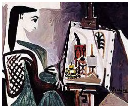
Figure 2. Picasso: Woman in the Studio- a study of self-reflection

The premodern is that which sees ethics as adherence to a traditional pattern typically grounded in religious authority. The modern is that which sees ethics grounded in a rational theory typically implicated with a conception of the human person as a free rational individual. The postmodern questions all groundings, whether traditional or rational, and it especially questions the modern emphasis on subjectivity, independence, and mastery.