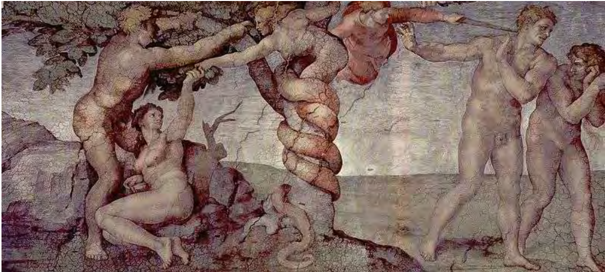
Figure 4. Michelangelo's painting of the sin of Adam and Eve (the Fall)

Another question which should still be asked is how the decision about the significance of the role played in another’s life was made. This is discussed in Section 6.4 of this chapter.