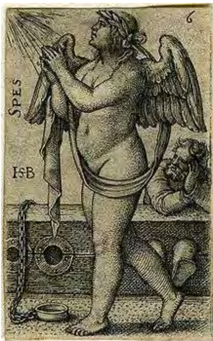
2-1 Spes of Hope; engraving by Sebald Beham, c 1540

Rahner portrays God as inspiring the world to shape human destiny and to liberate people to see God in all things, in order to know in that freedom that their search for meaning can only end in God.