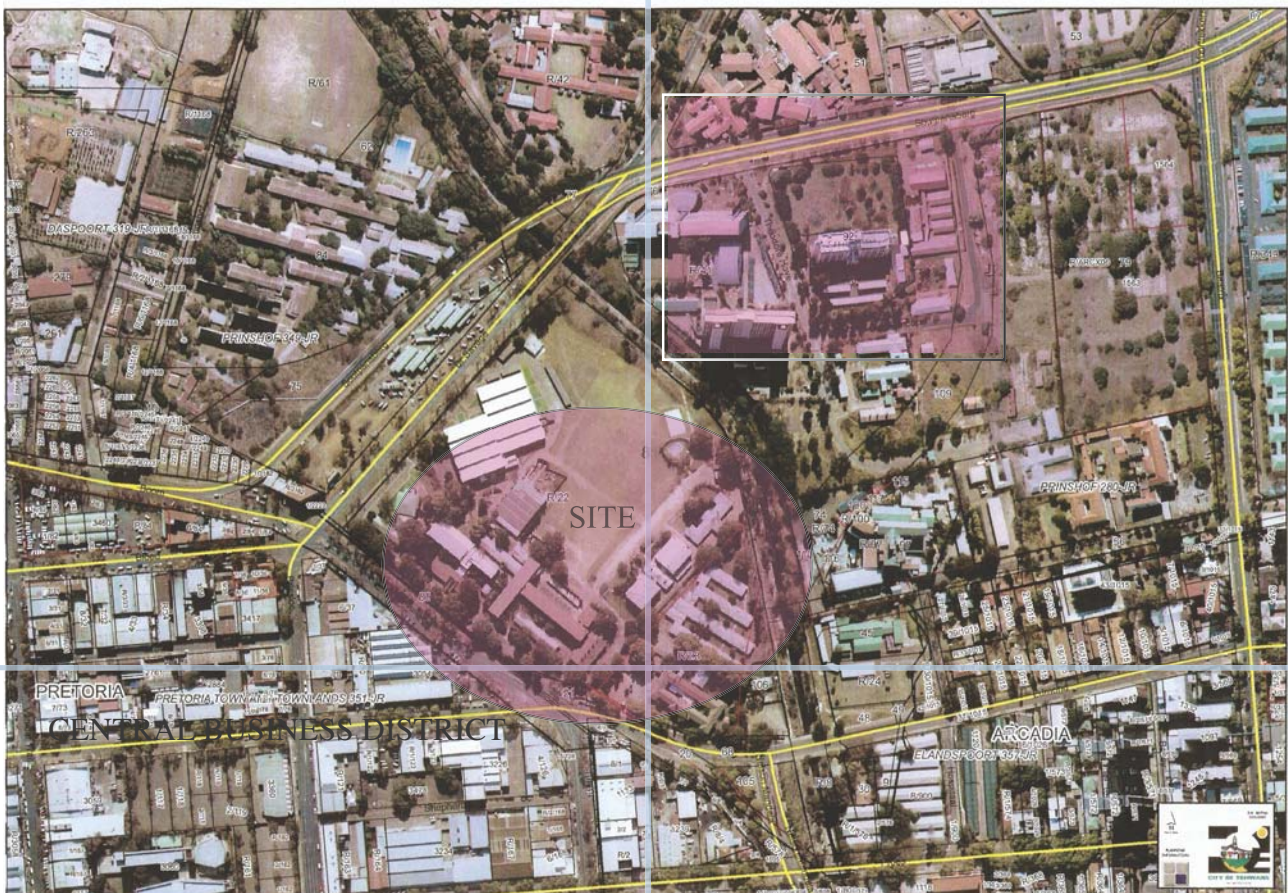
fig [02] EDUCATIONAL NODE