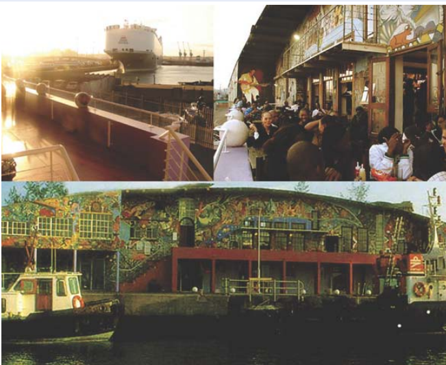
fig. [04] The Bat Centre; Durban

Durban, KwaZulu-Natal and South Africa by promoting local talent and skills.