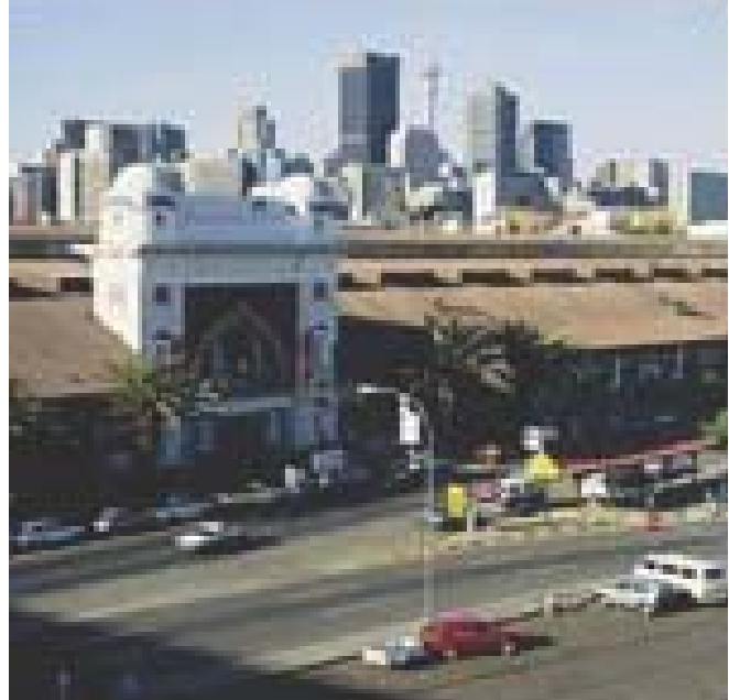
fig. [03] Newtown Cultural Precinct; Jhb

Some years ago, the Newtown area had degenerated into a slum overlooked by the derelict cooling towers and dark turbine hall of the first coal power station in Johannesburg. The main feature of the all new Newtown Precinct is the massive Victorian building which houses both the renowned Museum Africa as well as the Market Theatre.