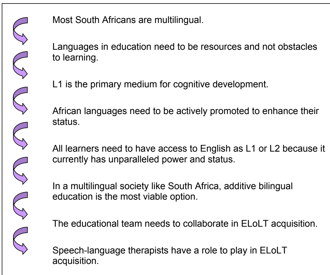
FIGURE 1.2: SCHEMATIC REPRESENTATION OF THE PROPOSED APPROACH TOWARDS ELoLT

Figure 1.2 illustrates an approach towards the acquisition of ELoLT in South Africa that may guide the speech-language therapist, as documented in the literature (Heugh, Siegrühn Plüddemann, 1995: vi).