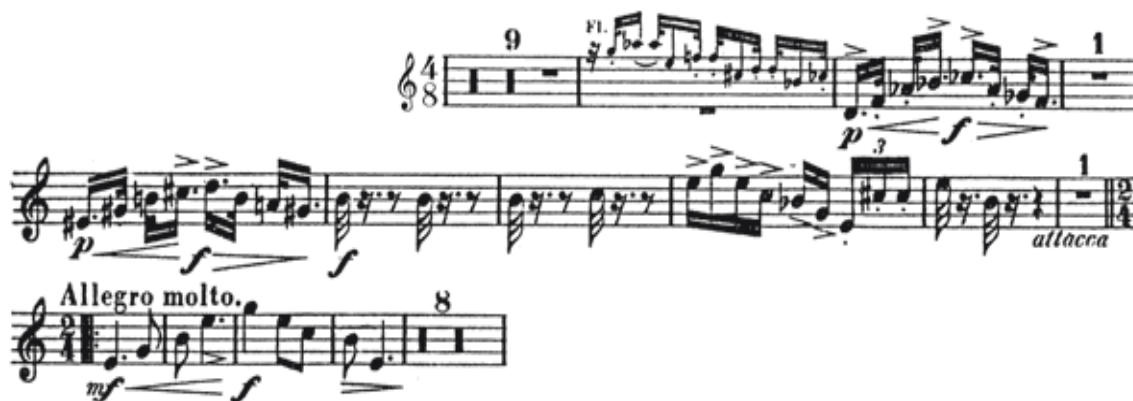
Figure 15: I. Adagio – Allegro molto mm. 16 – 27 Horn 3 + 4 in C

In both of the two opening passages of Figure 15, the accents fall on the four dotted notes rather than on each of the four beats. It may seem strange to the players to place accents on two notes in a row; the printed B-flat and C-flat in the first entry and on the C-sharp and D in the second. In my opinion, although the notes are ascending and there is a crescendo to forte on the first four notes, the accent on the fourth note (the B-flat/C-sharp) helps to propel the phrase forward even more towards the top of the crescendo on the third beat.