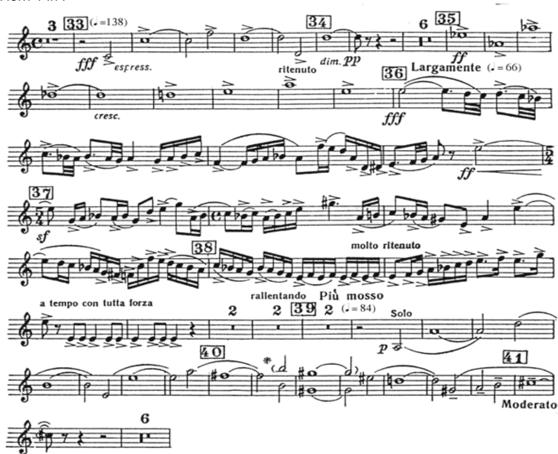
Figure 7: I. Moderato Fig. 33 – 41 Horn 1 in F

Figure 7 below shows the extended orchestral tutti passage from later in the first movement of this symphony (mentioned in Chapter 4), as well as the treacherous first horn solo that follows. When seeing these two passages together as they appear in the part, it becomes obvious why it is not prudent for the solo horn player to play the section from figure 36 to figure 39. Tuckwell (1983:103) relates that this passage can be “musically rewarding to play.” But, he continues: “The first horn must, however, resist the temptation to take part as he must shortly play one of the most difficult solos in the repertory” (Tuckwell 1983:103). The solo player can help out for a short period of time, e.g. from the pick-up notes into two measures before figure 38 for two beats and later in the second half of the measure at figure 38 itself, in order for the bumper or the second player to take a breath. Attempting more than this, though, is not a good idea as it can lead to the lips getting too tired.