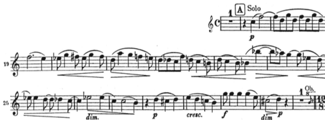
Figure 5: II. Adagio non troppo mm. 17 – 32 (fig. A – fig. B) Horn 1 in H

As in the previous example, breathing is an area of concern when playing this passage. The player is again faced with a long, legato phrase with few obvious places in which to breathe. The conventional breaths are as follows: at the end of measure 19, before the last eighth-note of measure 21, in measure 23 either following the printed C quarter-note or after the printed B-natural eighth-note and in measure 24 after the G that is tied over to the third beat. The reason for the ambiguity in measure 23 is that it is purely a matter of personal preference where this breath is taken. This is where the climax of the passage takes place; to my mind, it is better to take a breath earlier (after the C) still extending the crescendo for one more eighth-note, creating even more tension in this