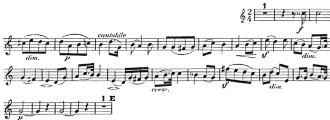
Figure 12: III. Adagio mm. 73 – 95 (5 after D – 4 before E) Horn 3 in D

In the third movement of this symphony is a lovely solo for the third horn (see Figure 12 below). It is not as exposed as many of the first horn solo parts and other third horn solos such as the previously discussed call in D from Till Eulenspiegel , but important nonetheless.