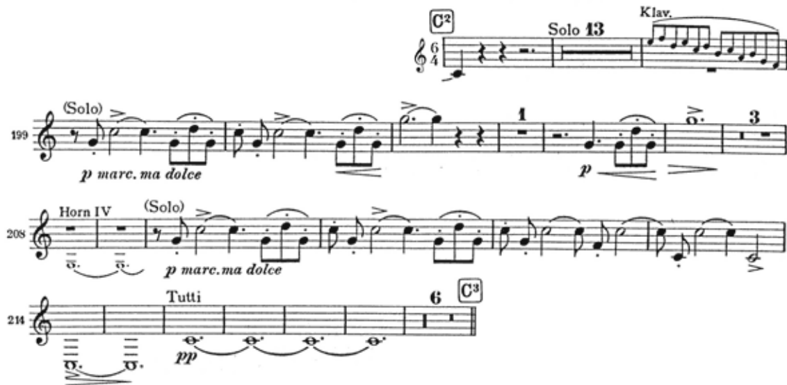
Figure 13: I. Maestoso mm. 199 – 216 (16 after C2 – 10 before C3) Horn 3 in F

The articulations in this passage are of particular importance. Differentiation must be made between the staccato markings and what Moore and Ettore refer to as “mezzo-staccato” markings (1986:80). These are notes that have dots on them, but which also appear under a slur indication i.e. the last three eighth-notes of measures 199, 200 and 203 and again in measures 210 and 211. Traditionally, these notes are played quite long, with a legato tonguing technique used on each note. The length of these notes must be consistent throughout the passage, as should the lengths of the notes that have staccato markings.