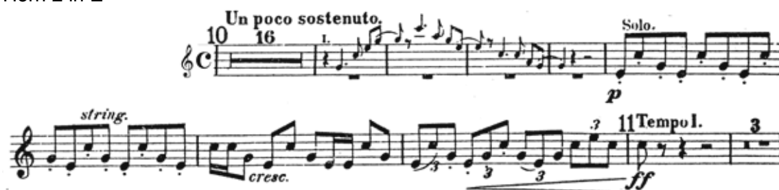
Figure 17: IV. Allegro con fuoco mm. 261 – 265 Horn 2 in E

Both players must make certain that they start piano and do not crescendo until the third measure where it is indicated. This is only a small swelling of the sound, with an effective molto crescendo in the measure before 11. In addition to this, there is a stringendo that has to be navigated. It is also of supreme importance that this does not take place too soon, beginning only in the second measure of the duet. As with the crescendo, this is traditionally quite gradual until the triplets begin one measure before Tempo 1.