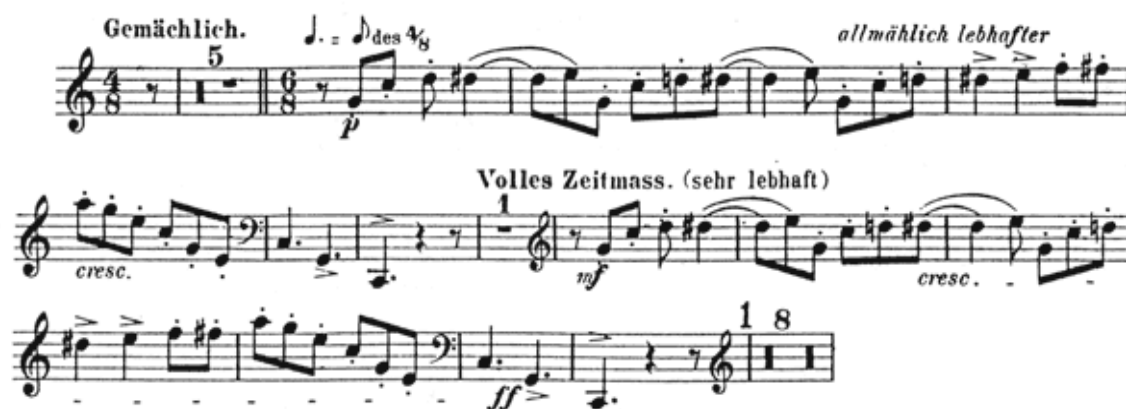
Figure 10: Beginning – Fig. 1 Horn 1 in F

The opening five measures are traditionally played in a relatively free tempo. Looking up for the initial measure and then proceeding to look away, concentrating on the passage to come, is likely to cause the horn player to lose the beat and then not be sure of when to enter. Therefore, as with the first horn solo from the second movement of Brahms's Second Symphony, it is a good idea to memorise this passage. This allows the player to watch the conductor for the entire introduction before beginning the solo so aptly described by Phillip Huscher in the programme notes from a CD recording of this work that was made in 1991 by the Chicago Symphony Orchestra under the direction of Daniel Barenboim. Huscher, the CSO's programme annotator, says that Strauss "begins by beckoning us to gather round, setting a warm 'Once-upon-a-time' mood into which jumps the horn with one of the most famous themes in all music – the daring, teasing, cart-wheeling tune that characterises this roguish hero better than any well-chosen words" (Huscher 1991:7).