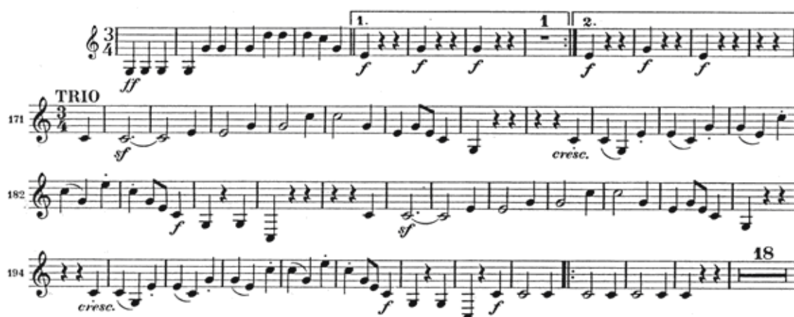
Figure 9: III. Trio: Allegro vivace mm. 171 – 201 Horn 2 in E-flat

The second horn player has by far the liveliest of the three parts. There is a tendency, especially if the tempo that the conductor chooses is a rather fast one, for the eighth notes in measures 176 and 183, and in the parallel passage in measures 192 and 197,