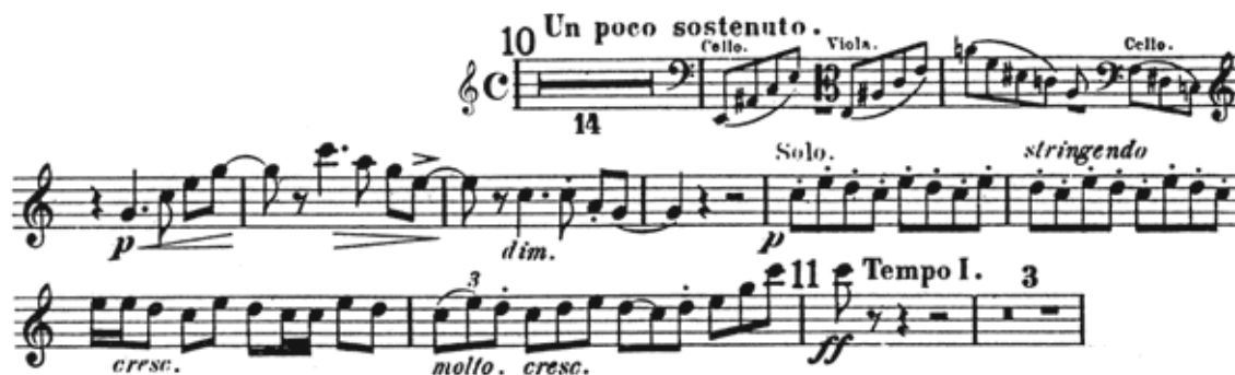
Figure 16: IV. Allegro con fuoco mm. 257 – 265 Horn 1 in E

This solo can make a first horn player nervous throughout the entire symphony, due to the top note and the exposed nature of the passage. Although it is reminiscent of the solo for third and fourth horn at the Allegro molto in the first movement, in this case it is played within a section which is slightly slower and more relaxed ( un poco sostenuto ), thus there is only one accent in the four measures of the solo. The player should begin at a dynamic of piano to allow for the crescendo to the top C; in this instance the orchestral texture is such that a level which is slightly above a normal piano should be sufficient. The staccato markings must also be carefully observed so as to give the feeling of lightness.