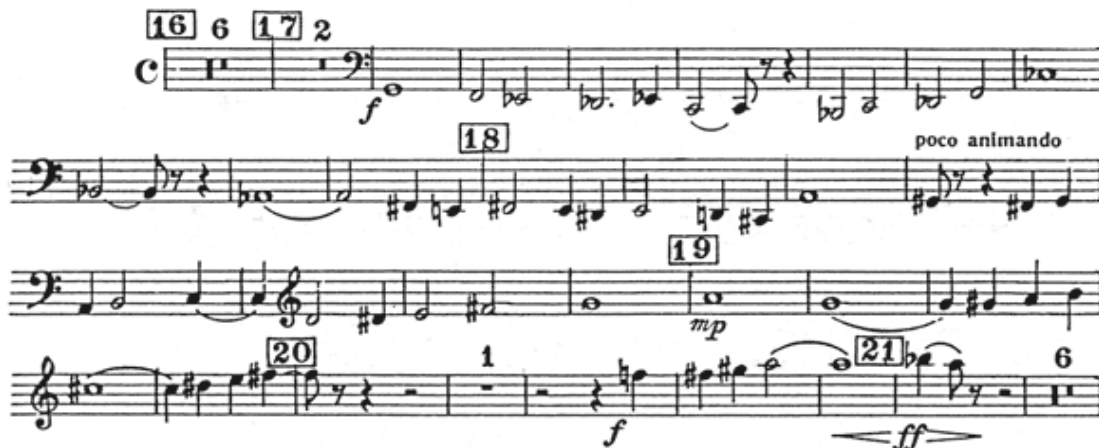
Figure 6: I. Moderato Fig. 17 – 21 Horn 1 in F

The Symphony No. 5 by Dimitri Shostakovich is not played as often as the symphonies of the same number by Beethoven and Tchaikovsky, but there is one excerpt from the symphony that will be found on virtually every audition. In the first movement of the piece, there is a low passage that occurs in all four horn parts (see Figure 6 below). This is a difficult passage for all of the players, but especially for the first and third players who are used to playing the two high parts of the horn section.