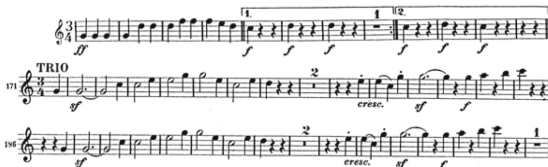
Figure 8: III. Trio: Allegro vivace mm. 171 – 201 Horn 1 in E-flat

Apart from the notes that have a sforzando indication, the Trio should be light in attack, with separation between the half notes and quarter notes. This is especially true in the last three measures of each printed line of music (measures 183 – 185 and measures 199 – 201) in order that the top notes are made to sound effortless. If each note is