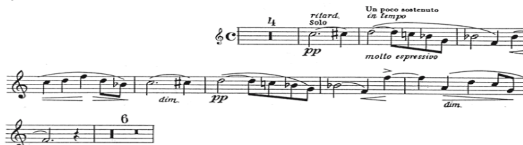
Figure 3: I. Allegro mm. 51 – 64 (7 after fig. 2 – 11 before fig. 3) Horn 1 in E

Depending on the speed of the movement, and of course a player’s breath control, if a big enough breath is taken in the measure of rest before the passage and if the tempo is