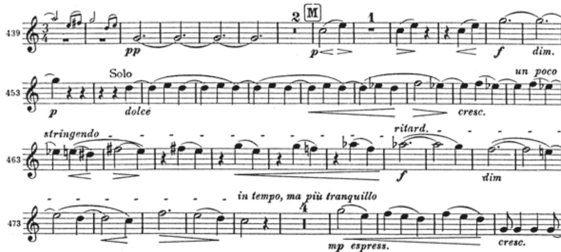
Figure 4: I. Allegro non troppo mm. 439 – 477 Horn 1 in D

Breathing is of fundamental concern in this passage. It is vital that a player begin the phrase with a big breath, as the next one should be taken only at the beginning of the crescendo in measure 461. The following breath – at measure 465 – is obvious; however, the rests on the downbeats of the next two measures should not be used to “tank up” as this breaks up the phrase and causes it to become very choppy. Green and Gallwey (1987:70) note that Claude Debussy is quoted as saying that “music is the space between the notes”. In this instance, there must be a definite space between the notes, but the phrase carries on in spite of these breaks. These measures are at the height of the stringendo thus, if the phrase is approached in this manner, this helps with the forward motion of the line.