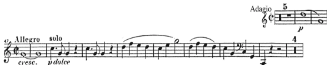
Figure 14: mm. 45 – 55 Horn 2 in E

As this solo is in Horn in E, everything is transposed down a minor second. This makes the fingerings more complicated now that the key signature becomes that of B-natural, which has five sharps. Therefore, as a colleague of mine remarked when asked for his views on how to play this excerpt, “it’s all fingering patterns and they must be ingrained in the memory.” The player must not be worrying about what fingerings to use, e.g. whether to play the last five notes on the F side of the instrument (using only the second finger for the entire measure plus a downbeat) or to use B-flat fingerings. Which fingering system a player tends to use is a matter of individual preference; in other words, playing on the B-flat side of the instrument except for a few notes that must be played on the F side, or playing on the F side exclusively until the second-space A. For this passage there are not any “trick” or alternate fingerings, so it is simply a matter of the player deciding on the fingerings to be used.