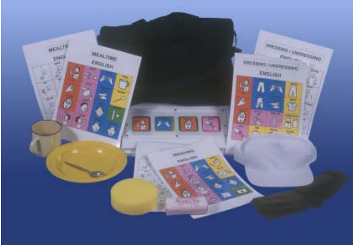
Photograph 1 The elements of the BCIP

The BCIP also includes some principles for facilitating interaction with both peers and adults (e.g. by having a party and inviting neighbourhood children) in order to facilitate social inclusion. One of the key characteristics of increasing participation and interaction is that people have close proximity and frequent opportunities to interact with each other (Falvey, Forest, Pearpoint & Rosenberg, 1994). In order to facilitate close proximity with potential communication partners CSDs should be included in their communities (e.g. attend local schools, church, etc.) as this will heighten the possibility of forming bonds that will result in friendships. Therefore a communication training programme should highlight the importance of social inclusion to increase the number of potential communication partners. Communication partners should be taught to recognise the CSDs' communication means (which are often subtle and ambiguous), how to