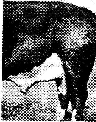
Figure 2.1: Bull with a broken penis. Note the swelling between the sheath opening and the testes. (Taken from Bearden and Fuquay, 1997)

2.1). In some cases the penis has even been amputated by tight rubber bands lost from the artificial vagina during semen collection (Bearden and Fuquay, 1997)