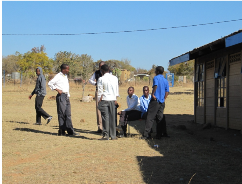
Figure 4.3.3: Learners sitting outside without supervision

Short, Short and Blanton (1994, p. 13) are of the opinion that teacher participation in planning and the implementation of safety plans is mandatory. More importantly, the teacher provides a critical variable in the total school effort through development and utilisation of problem-solving skills. Students should know what the school expects of them and what the consequences will be if they do not meet these expectations. Short et al. (1994) claim that most students will fall in line with expectations.