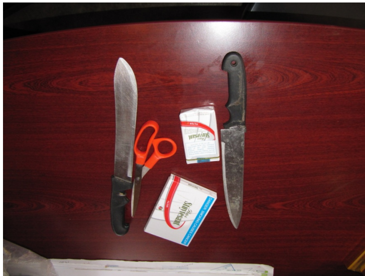
Figure 4.2.6: Weapons and drugs found on learners

The principal in school A described stabbing, fighting, and stoning as frequent causes of injuries at school. When asked what solutions the staff have formulated, he said that they phone the police to come and assist.