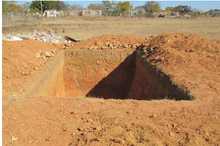
Figure 4.2.1: Dangerous pit, which is not covered

In terms of gates and security, the school's lack of resources led to the failure by the School Management Team to employ a properly trained gate controller or security guards, as indicated in figure 4.2.2.