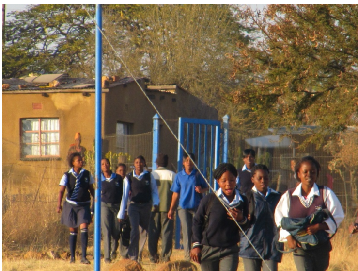
Figure 4.2.4: Unsupervised learners at the school gate

I arrived at the school at 07h00. Learners arrived at school from various directions and entered the school by either of the two gates. The caretaker unlocked all the classrooms and left. Learners entered the gates unsupervised, and there were no educators supervising the classrooms. Some learners were seen hanging about in groups. When I peeped through a window I discovered that some of them were gambling. The first staff member to arrive was the principal. Other educators arrived and waited in their offices until lessons were due to start. The school bell rang at 07:45 and learners went to the assembly. About four educators assisted learners at the assembly.