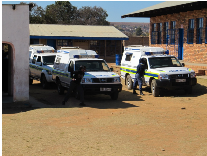
Figure 4.2.5: Police vans in the school

As indicated by the photo below, police were called when a fight broke out.