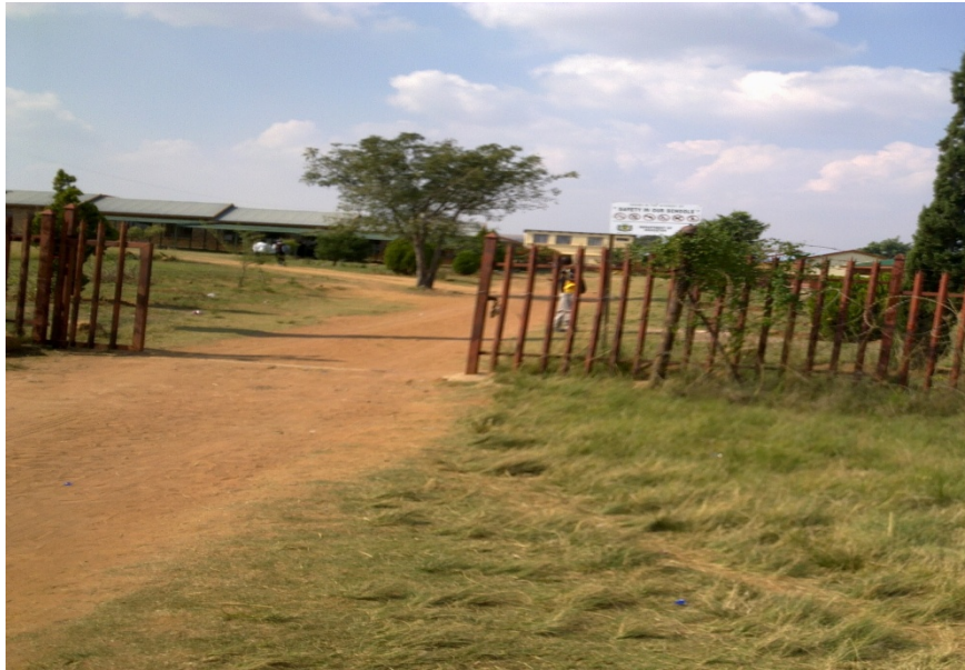
Figure 4.3.2: Uncontrolled gate

I observed in school B is that gates are always locked during the school day, even during the long break. Learners were always lingering around the gate. Sometimes they were requested to open gates for cars or people coming to visit the school since there was no gate controller. When a car approached the gate, learners scrambled to go outside, the moment the gate was opened for the visitors, which is dangerous and compromises the safety of learners. Some learners fell as they competed to move outside the school premises.