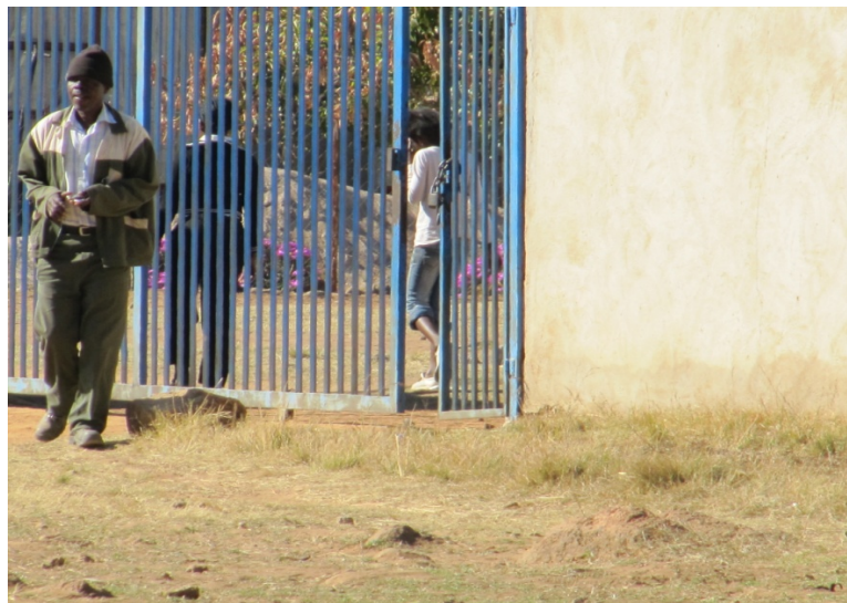
Figure 4.2.2: Untrained gate controller

Figure 4.2.2 confirms the finding that gate control is inadequate, which poses a serious threat to the safety of learners in school A. The response of one of the School Management Team was: "The security guard at the gate does not have any weapon to deter criminals. The school does not have enough funds to employ trained security. The subsidy from the Provincial Department of Education is not enough, and a large amount of money is channeled into curriculum stationery, sport and transport."