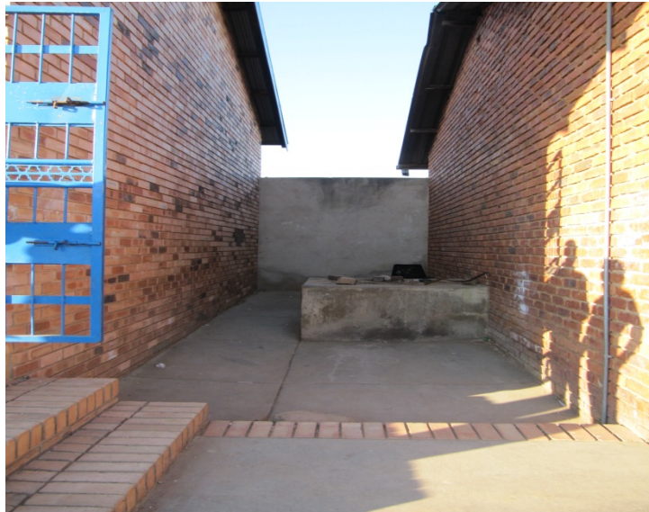
Figure 4.4.2: Corridors where learners can hide

The grounds of school C are fenced off. The grounds were generally neat and litter-free on the day of the observation, but there was a lot of dust. There is no grass covering the playground. It is very difficult to play during dusty conditions or windy weather. No sports facilities were visible. The school kitchen was just a small room. Class monitors collect food during break, amongst stiff competition. Some learners eat in groups outside the classrooms. They move freely from class to class without supervision by educators.