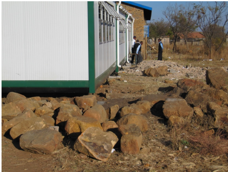
Figure 4.2.3: Rocks outside classrooms posing danger to safety of learners and educators

Some learners loiter in corridors during the changeover between periods. I often observed unsupervised groups. Some of them smoke or conduct gang meetings. There is evidence of tobacco in the corridors and a heavy smell of smoke. Learners hang around, waiting in corners and on stairwells to trouble anyone who dares to pass through ‘their’ territory. This normally happens during the exchange of periods when teachers are on their way to the staff room or classroom. I observed that immediately when they see educators approaching, they disperse. I asked one of the SMT members why teachers do not control such groups. The response was: “There is no plan to monitor learners during the exchange of periods; normally educators are interested in what is happening in their classrooms during the lesson.”