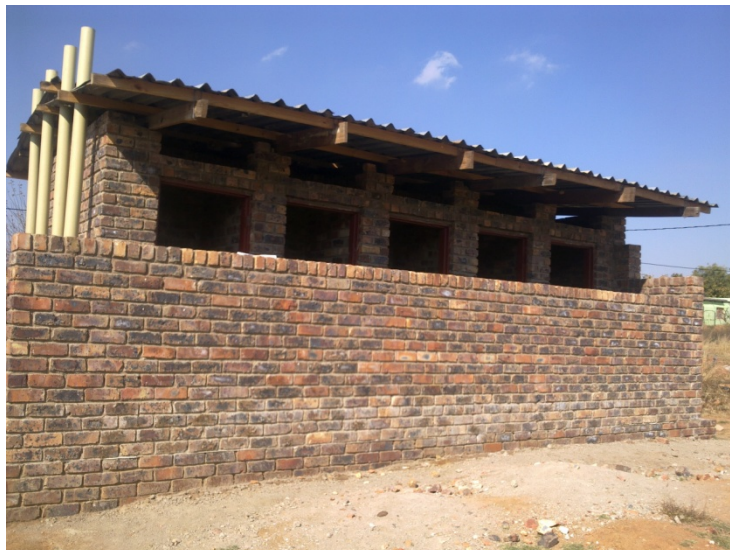
Figure 4.3.1: Better structured toilets

There is no guard at the gate to control the movement of learners or strangers. Visitors are not recorded in any way. The photo overleaf shows that gate control is non-existent, which poses a serious threat to the safety of learners.