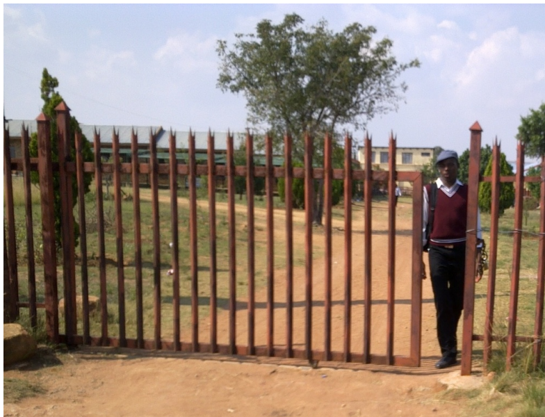
Figure 4.4.1 Controlled gate

The perimeter of school C is fenced with palisade fencing about two metres high. There is no barbed wire around the fence which is in good condition, and prevents people from gaining access to the school. Legal access is gained via one gate which is opened at 6:30. There is no pedestrian gate. During the time of observation the gate was closed at 15:30. The principal was the last person to depart from the school.