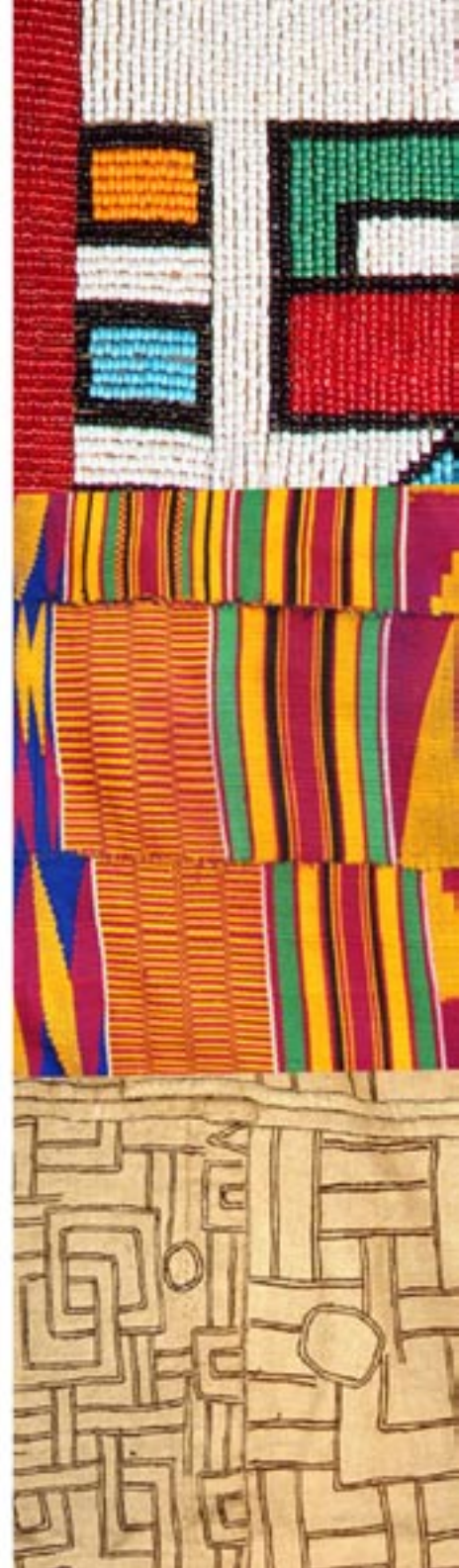
Fig.4 African texture

These statistics (refer to appendix one), show the current trend towards hotel accommodation and a need to respond to this in a design proposal. This could be because hotels offer clients a sense of privacy in comparison to traditional bed and breakfast guesthouses where more social interaction with the hosts occurs and thus, personal privacy is reduced. A more formal approach to services in a hotel affords guests the freedom to arrive and depart at any time to do business to the city. Hotels also provide more services to the guests at a lower price. It is thus clear from this statistic that hotel design in South Africa will be financially feasible.