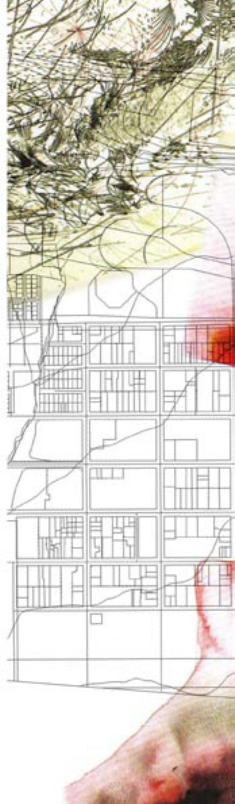
Fig.2 Nature meets city