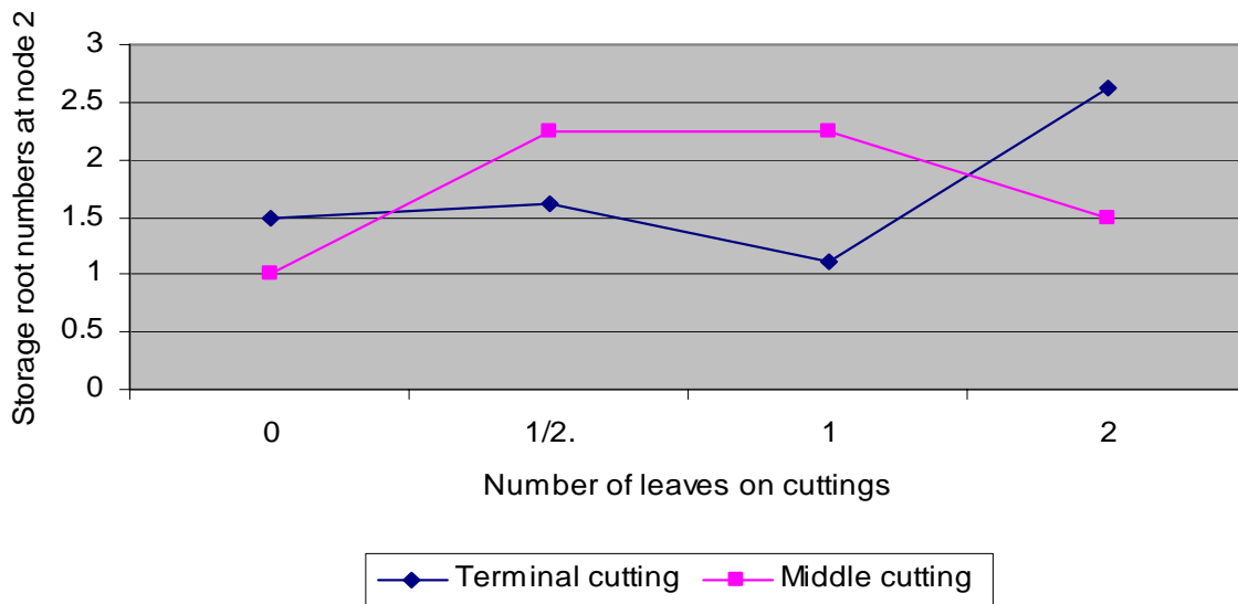
Figure 5.2 Interaction between type of planting material and number of leaves on cuttings on storage root number at node 2 Experiment 2