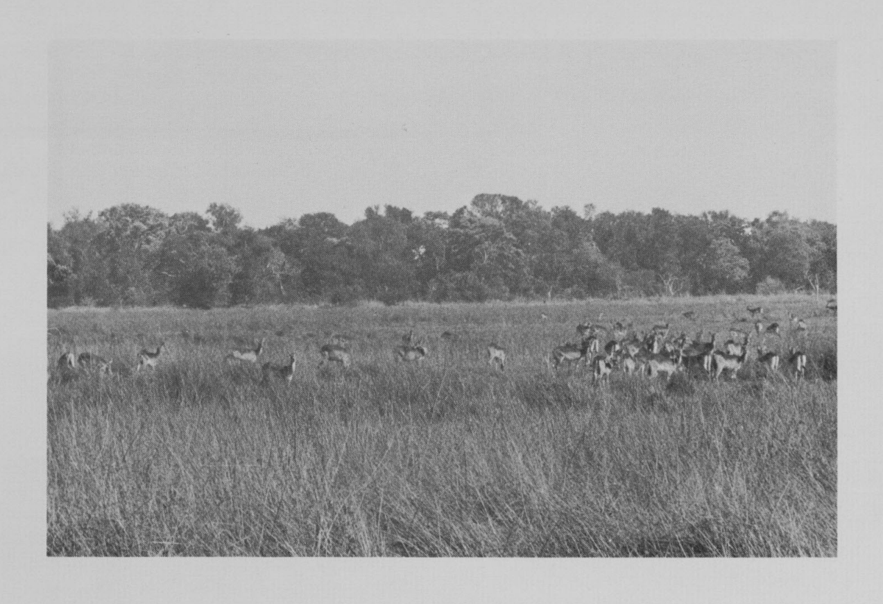
FIGURE 16 – Dry Primary Floodplain Community with Closed Riverine Woodland in background, the former heavily utilised by red lechwe, Khwai River floodplain, Okavango Delta, Botswana.