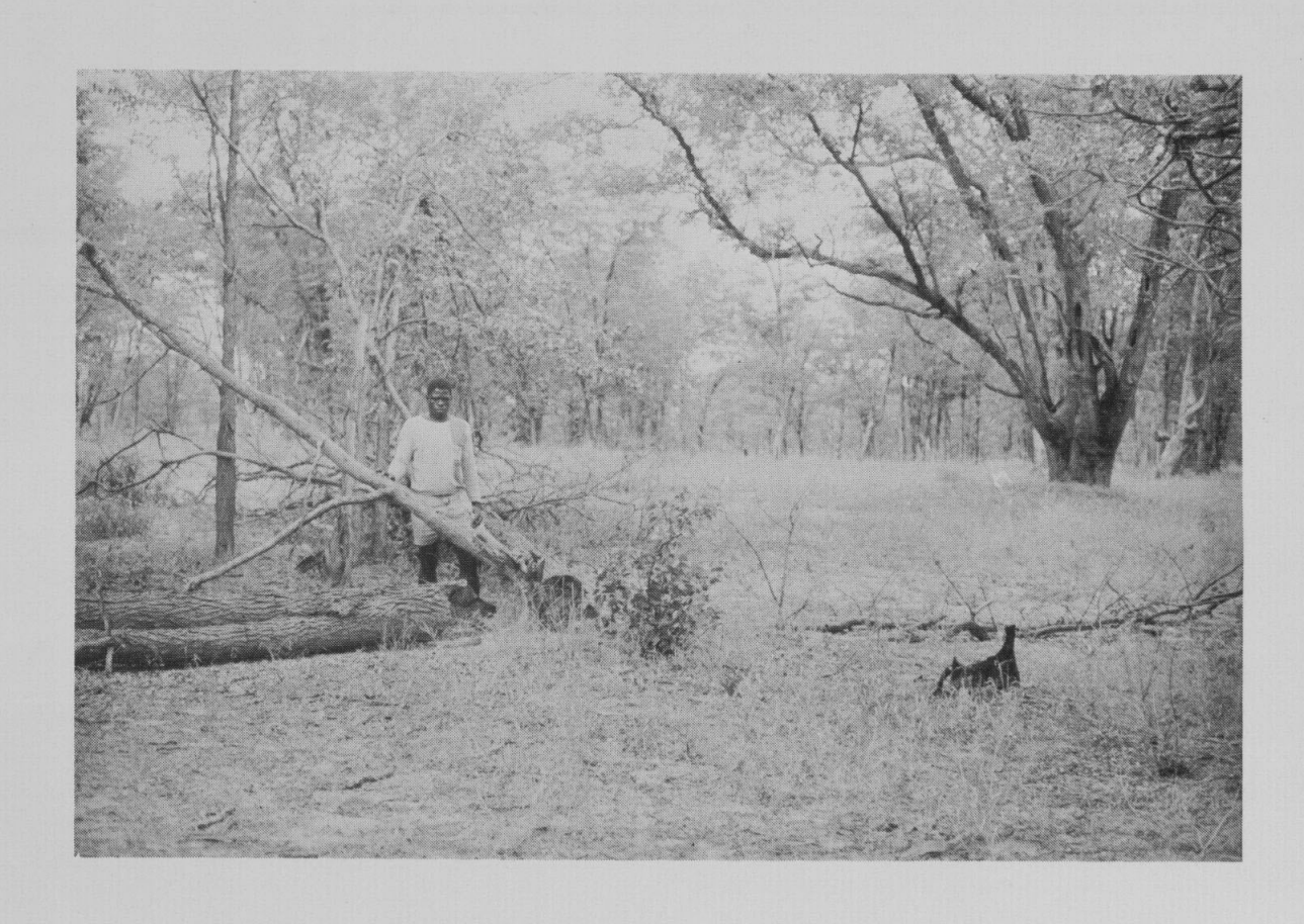
FIGURE 21 — Fire damage in Colophospermum mopane Woodland with commencement of Pyrophytic Scrub Savanna development, Chief's Island, Okavango Delta, Botswana.