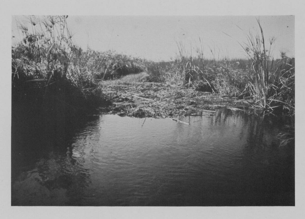
FIGURE 14 — Surface blockage of floating debris with sedges established further back along blocked Outlet Channel Community. Headwaters of Xudum River in the Xho Flats vicinity, Okavango Delta, Botswana.