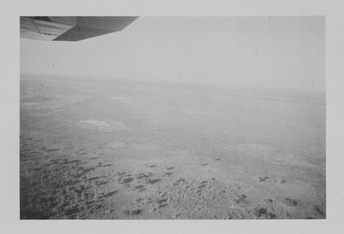
FIGURE 19 — Secondary Floodplain Communities in the mid-M'borogha River floodplains no longer receiving surface inundation even in years of excessive high water levels (1974), Okavango Delta, Botswana.