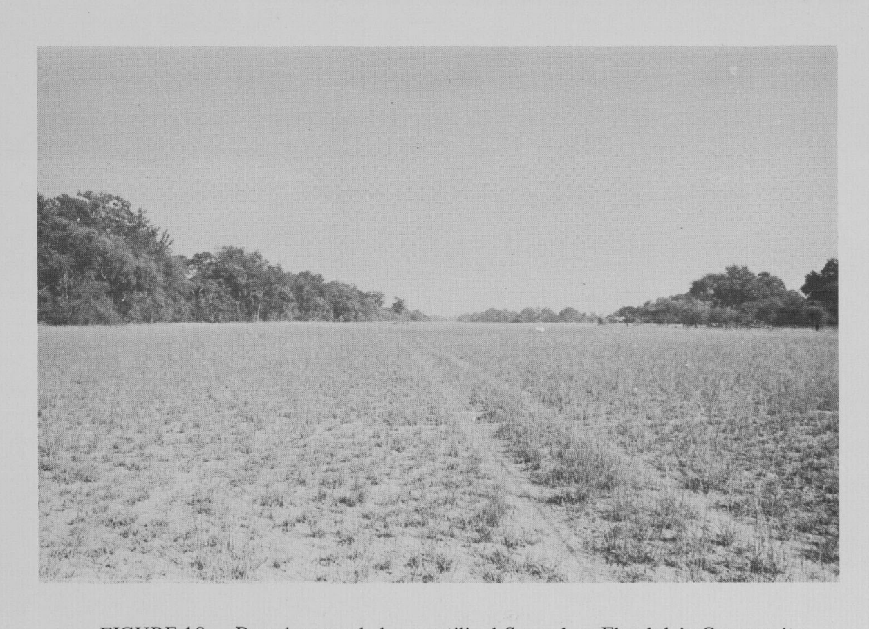
FIGURE 18 — Dry, downgraded, overutilised Secondary Floodplain Community, not receiving sufficient annual surface inundation, lower Boro River floodplain, Okavango Delta, Botswana.