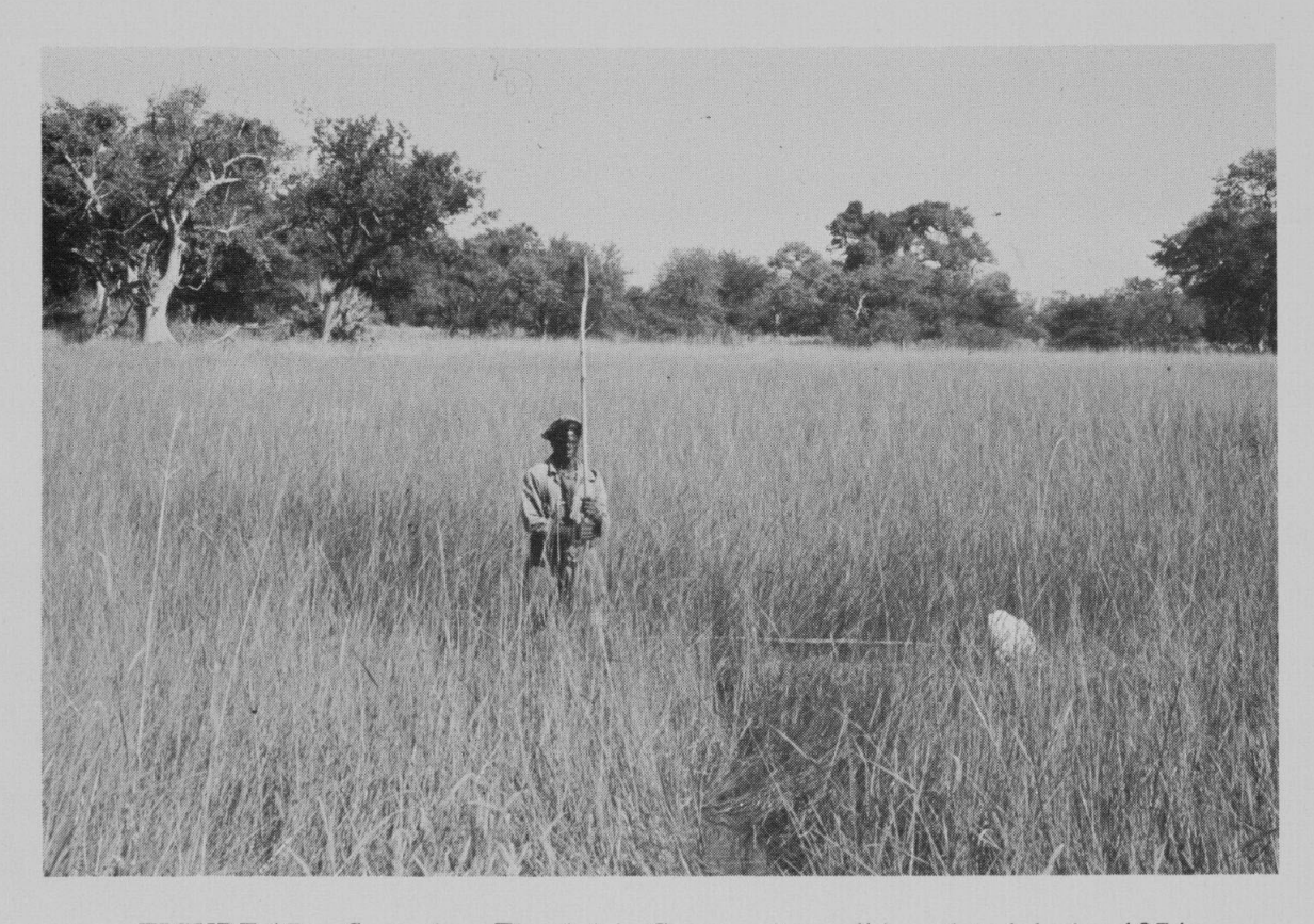
FIGURE 17 — Secondary Floodplain Community well inundated during 1974, but not inundated during 1973, Mid-Boro River floodplain, Okavango Delta, Botswana.