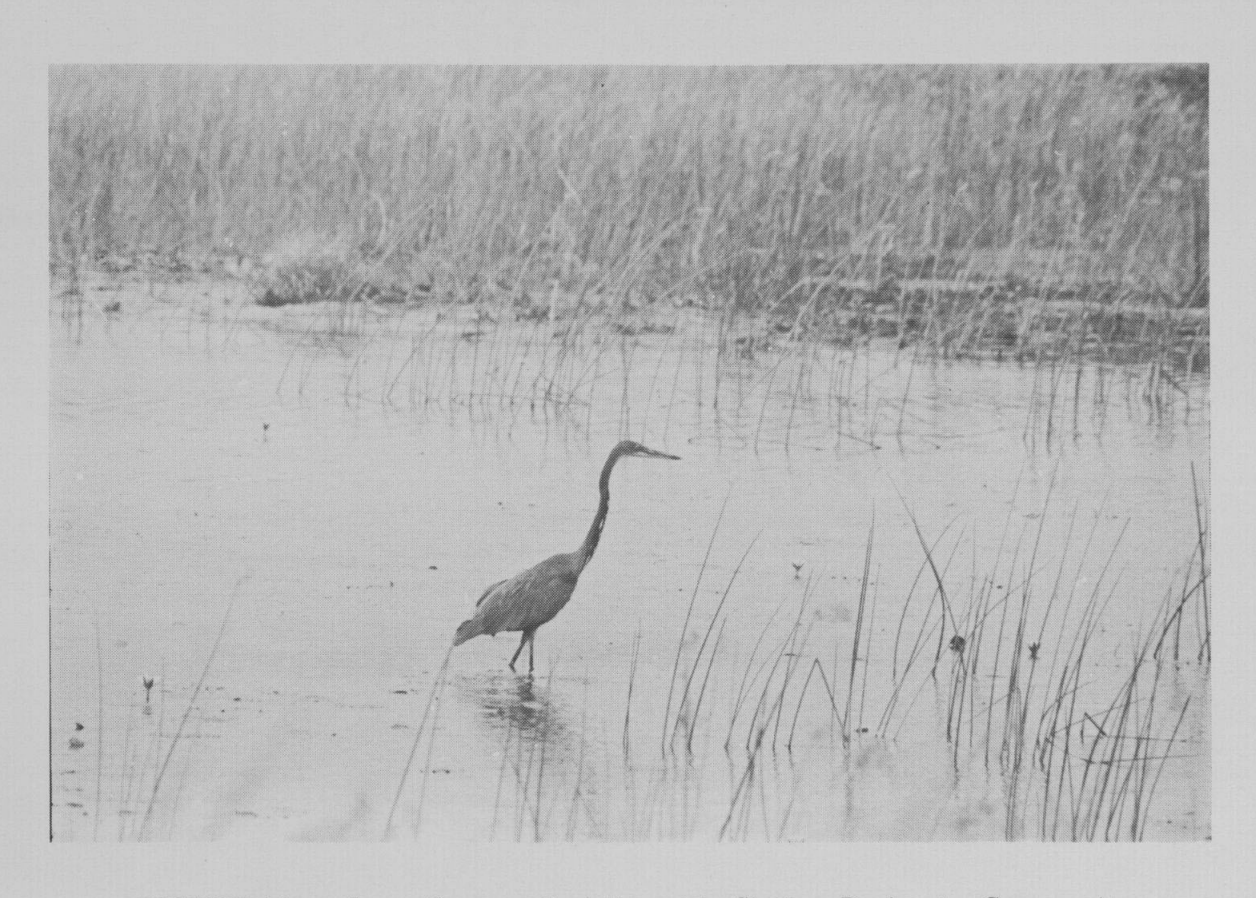
FIGURE 15 — Sump Community adjacent to Shallow Backwater Community, Boro floodplains, Okavango Delta, Botswana.