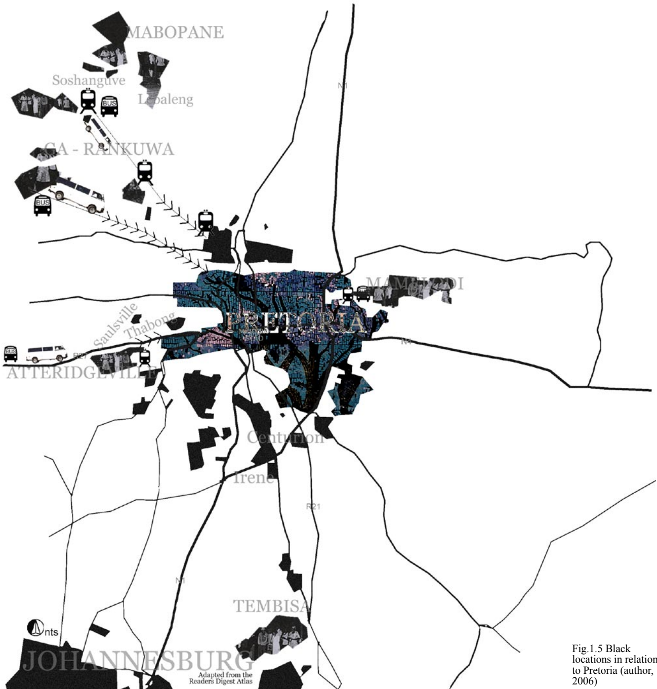
Fig. 1.5 Black locations in relation to Pretoria (author, 2006)