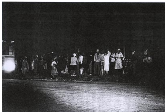
Fig.1.4 Commuters waiting for bus at 2:45 a.m. (Badsha, 1989)

Today, Marabastad is a poor community consisting mainly of commuters, hawkers selling to the commuters, wholesalers selling to the hawkers and other bargain shops. The study is an attempt to facilitate the needs of the part of the community viewed as most exposed to the environment (physically, socially and politically), namely the hawkers. The site chosen for intervention is relatively small, for the reason that success in a context such as Marabastad, is more likely at a small scale than at a larger scale. The design could serve as a pilot project, which if successful, could be a trail-blazer for similar projects and subsequently, through many small projects, a whole area could be rejuvenated. By addressing the needs of the hawkers through the intervention, the potential exists for the other groups in the Marabastad community to also benefit.