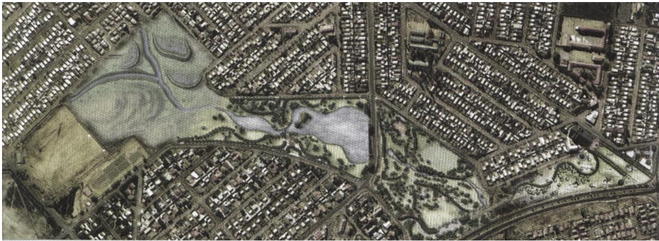
Fig. 1.6 Thokosa Dam Moroka Park Precinct in Soweto - an example of township upgrading (Darroll, 2002).