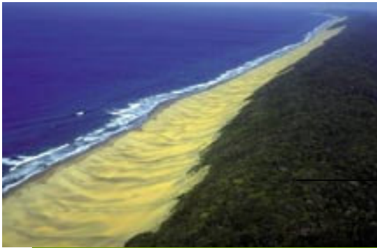
14 Intact forested dunes at St.Lucia. They were threatened by mining as in Richards Bay