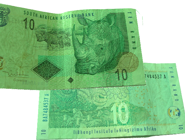
19 Money is very green

We almost randomly select species and areas to conserve. The environment is ever changing. We see the environment in terms of human time- in the case of St. Lucia, what now is forest was grassland only 100 years back. We are quick to protect and conserve our trees, but the trees are "unnatural", they are only there because humans have stopped the burning of the grasslands. These ideas and criticism of so called green and pro-conservation movements have led to a resent new paradigm- that of ecological skepticism.