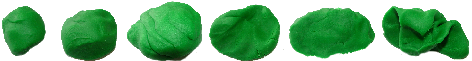
16 Green clay changing and molding as does our dominant paradigm and relationship towards the environment