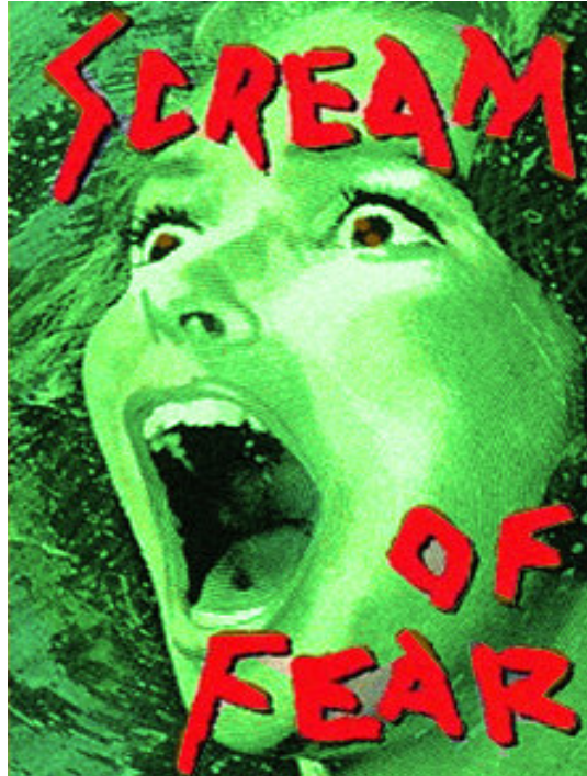
18 Humans fear nature but also fear its destruction

"The exponentially increasing Sixth Extinction can be shown pretty convincingly to parallel humankind's headlong expansion in numbers from literally one of a kind some 140 000 years back to over six billion individuals today. And this population explosion can be inseparably tied to three successive, seminal communication revolutions: language, writing and printing. It is ironic that it is our sheer genius that is propelling us towards our pending demise." (Anderson, 2000: 23)