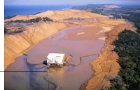
15 Dune mining activities at Richards Bay