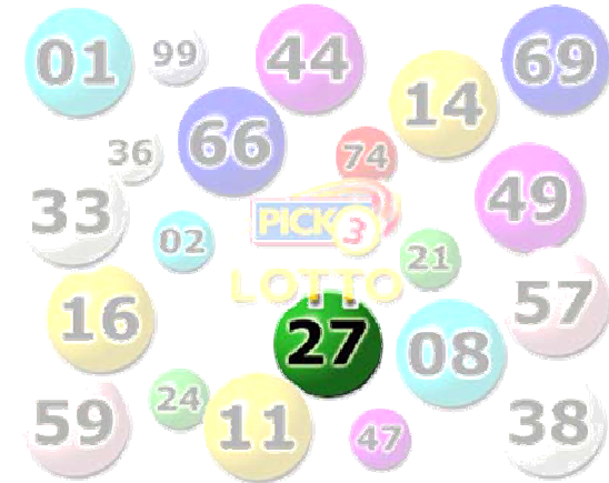
20 Conservation is a selective and random activity

"...but the fact is that that there is only one other extremely pertinent quality about life on Earth: it goes extinct. Quite regularly. For all the trouble they take to assemble and preserve themselves, species crumple and die remarkably routinely. And the more complex they get, the more quickly they appear to go extinct. Which is perhaps one reason why so much of life isn't terribly ambitious?" (Bryson, 2003: 298).