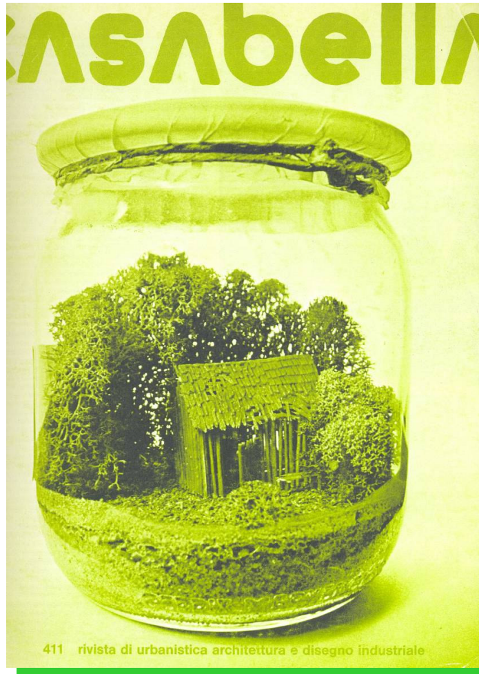
17 Preservation and Conservation: an abstract human concept (Casabella, Milan, no.411, March 1976)

The answer to 'what develop and what conserve' thus lies within the dominate paradigm of the current time. To formulate the current paradigm we need to state both sides of the debate: Pro-conservation and Anti-conservation. Refer to points 4.3 and 4.4 respectively.