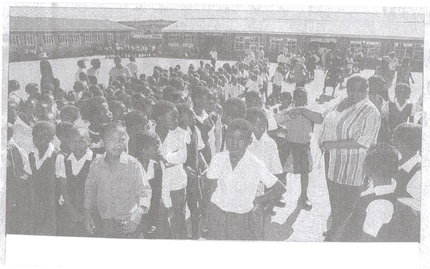
a. Learners from a township primary school 15 kilometers from the city of Pretoria