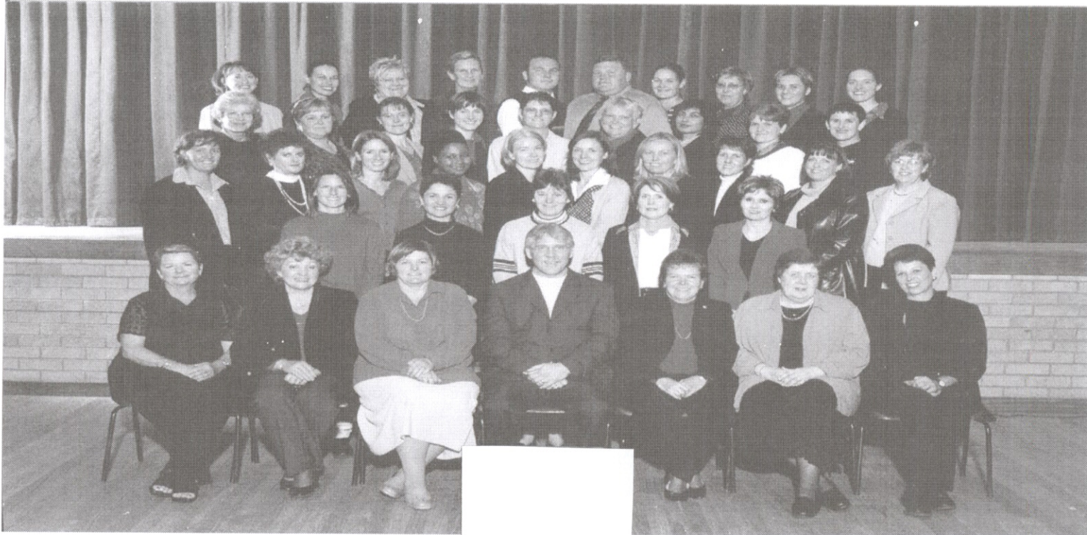
The faces of teachers at most desegregated schools in South Africa