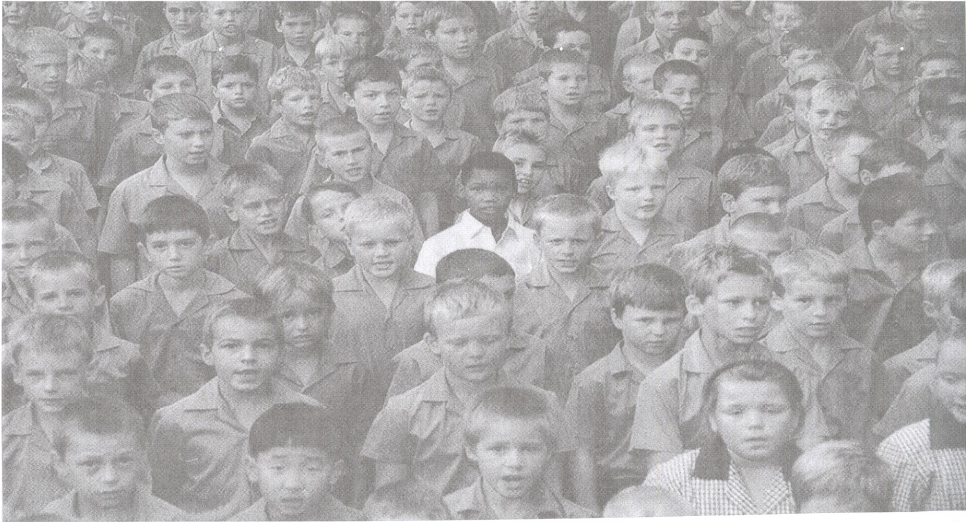
b. Learners from a primary school in the Eastern side of the city of Pretoria