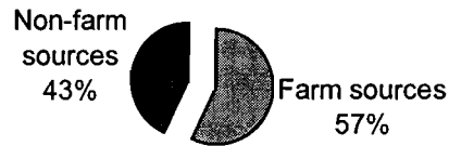
Figure 2. Farm and Non-farm Sources of Income Boane District January 2002