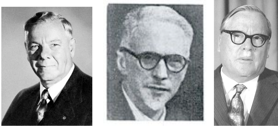
Figures 9-10: From left to right: H. F. Verwoerd; Albert Hertzog; P. J. Meyer.

continued to refuse to introduce television until the end of the 1960s, the fervour with which the verkrampes condemned the medium abated. 6