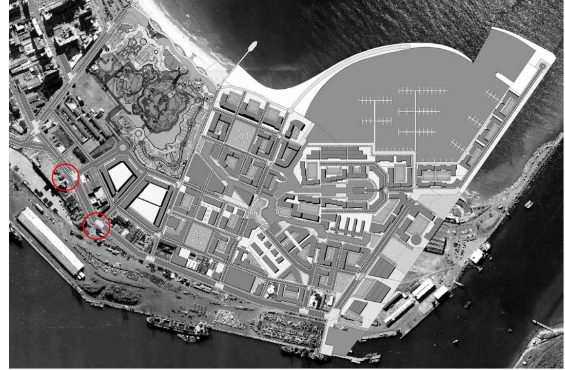
suggested connection points of walkway to the Point Development [ interview wood: 29 July 2005]