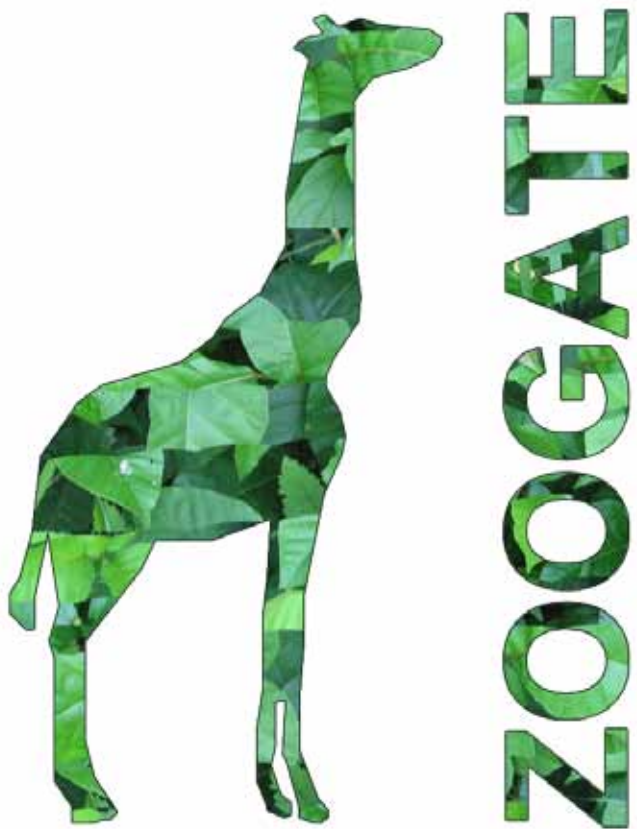
figure 183. zoogate logo