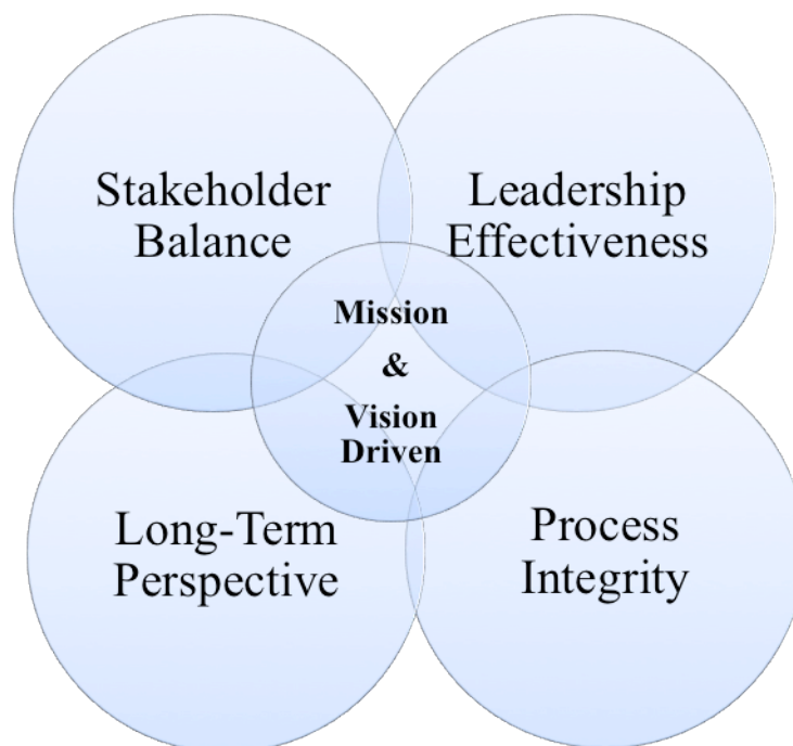
Figure 2 Five-cluster characteristics of ethical organisational cultures