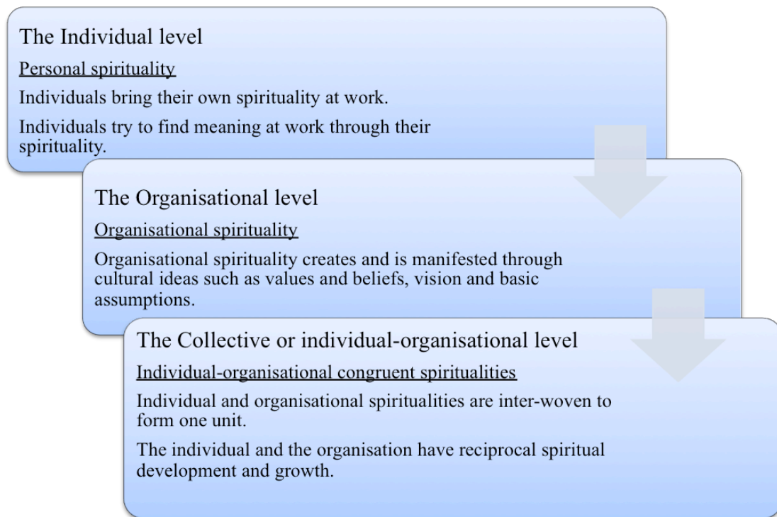
Figure 3 Conceptualising organisational spirituality: individual, organisational and individual-organisational levels of interaction