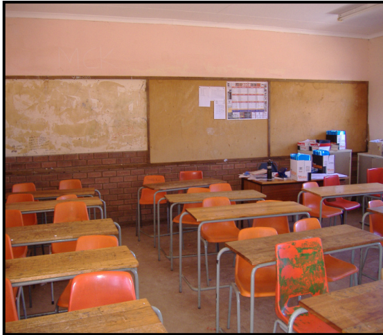
Figure 2: Example of a Life Orientation classroom