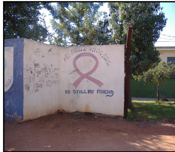
Figure 3: Examples of painted HIV & AIDS murals