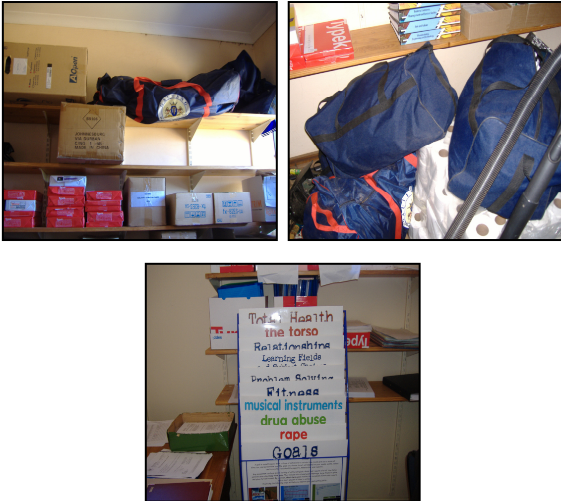
Figure 1: Examples of unutilised HIV & AIDS and Life Orientation resources