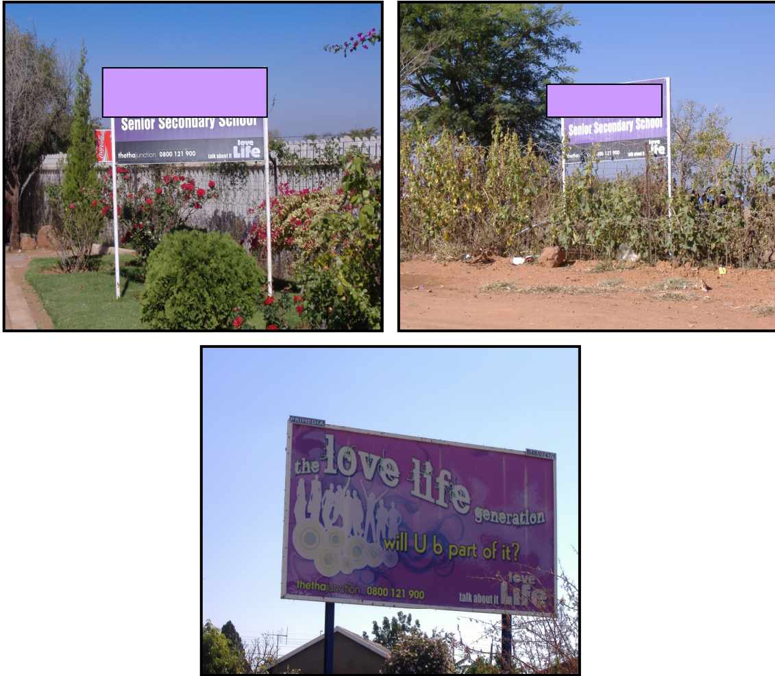
Figure 4: Examples of love Life involvement in the schools and community