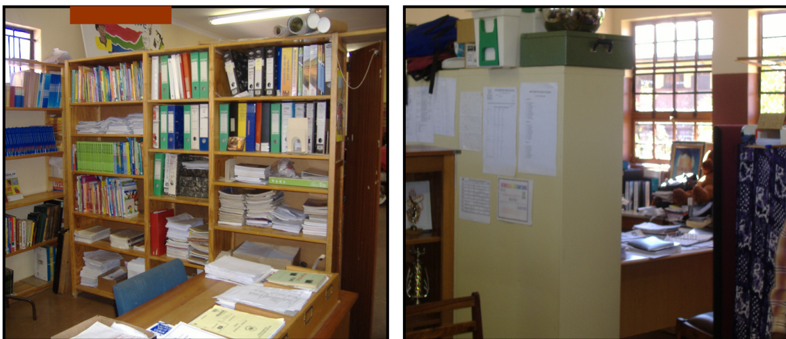
Figure 5: Library utilised as a staffroom