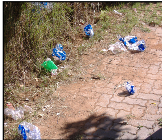
Figure 7: Examples of the surroundings in Case Study 1