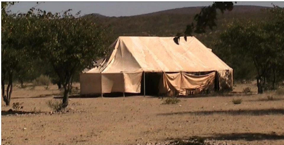
Figure 6.2 Mobile school unit: tented classrooms

This mobile schooling concept was welcomed by the Himba, Zemba and other nomadic communities as it seemed to fit their way of life. The mobile school concept entailed the creation of a tented classroom that could be dismantled to follow the communities when they moved to the next point or location.