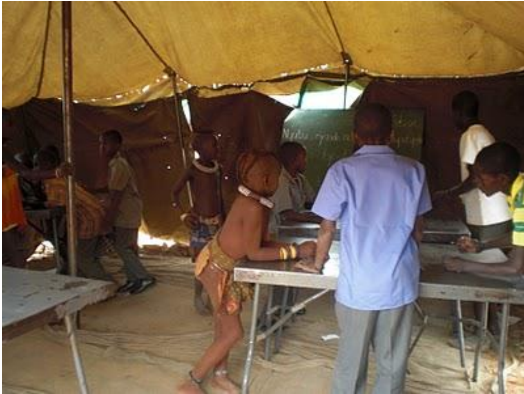
Figure 6.3 Inside the tent classroom

In 1998, the first six mobile school units were established, and by 2010, the number had increased to 45 mobile school units in operation across the north west and south Kunene region. The main target group for the Ondao Mobile Schools were children from the Himba and Zemba communities, who are among the least educated groups in Namibia. Access to these schools is not restricted and any child can enrol in a mobile school.