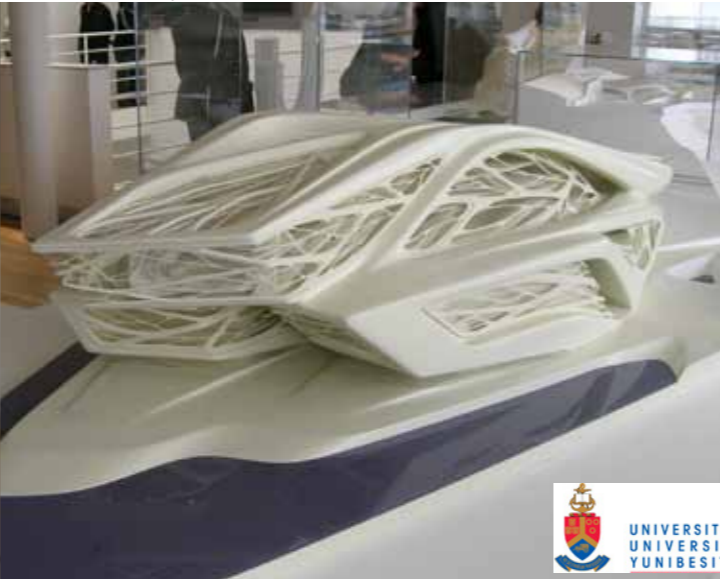
FIG 2.12_Zaha Hadid Exhibition, London, UK