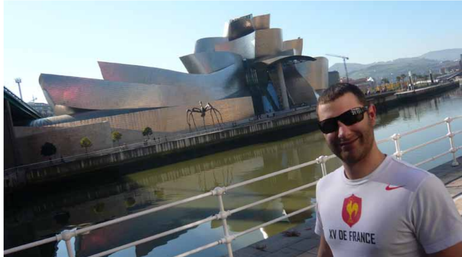
FIG 2.5 - 2.8_ Photo's taken by Author, Guggenheim Museum Bilbao, Spain, Frank Gehry, 1997

FIG 2.4_Photo of Author, Guggenheim Museum, Bilbao, Spain, Frank Gehry, 1997