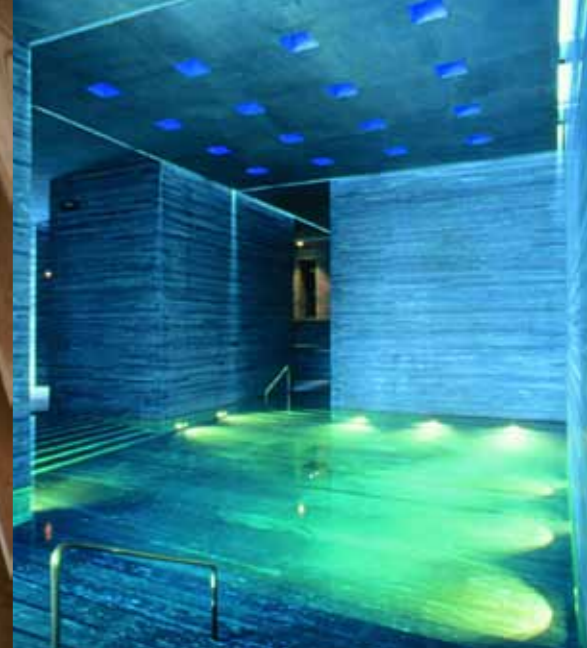
FIG 2.23_Spatial experience enhanced with colored light FIG 2.24_Materiality enhanced with shadow FIG 2.25_Calm spatial quality, Thermal Baths Vals, Graubünden, Switzerland, Peter Zumthor, 1996