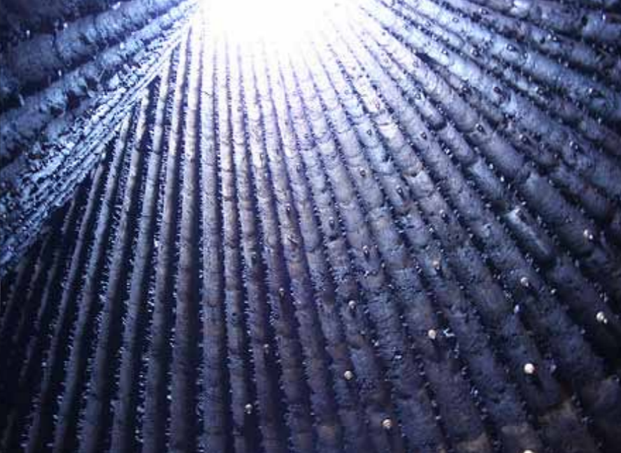
FIG 2.19_Bruder Klaus Field Chapel, Wachendorf, Germany, Peter Zumthor, 2007