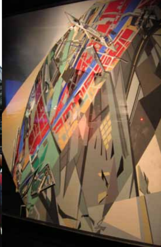
FIG 2.10_Zaha Hadid Exhibition, London, UK