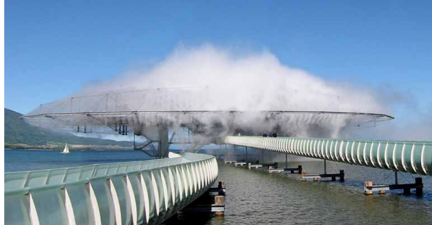
FIG 2.16_Blur: Braincoat, color coded and vibrating raincoats matching visitor profiles in Blur Building, 2002