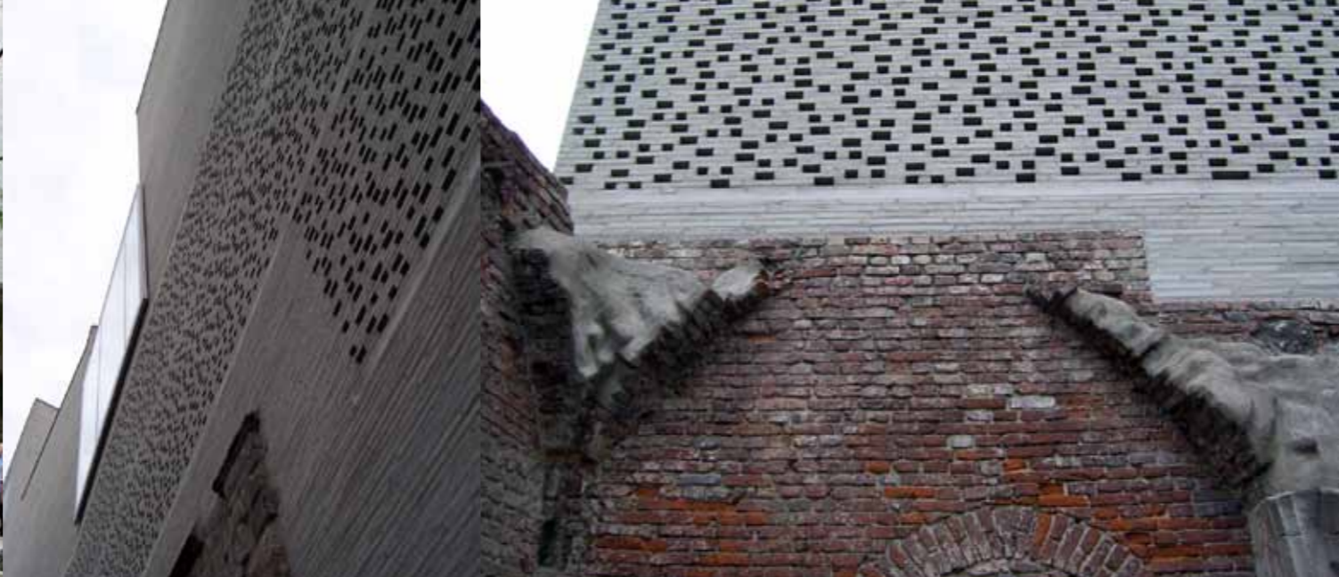
FIG 2.27_ Kolumba Art museum, Cologne, Germany, Peter Zumthor, 2007