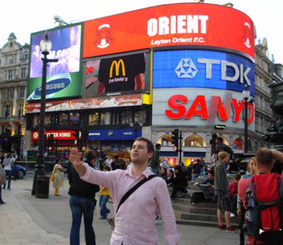
FIG 2.9_Photo of Author, Piccadilly Circus, London, UK