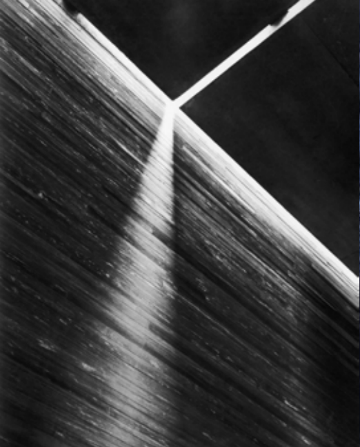
FIG 2.18_Dramatic play of shadow on textured wall FIG 2.20-21_ Intimacy and calmness of interior space displayed through multifunctional contemporary glass facade, Kunsthaus, Bregenz, Austria, 1997