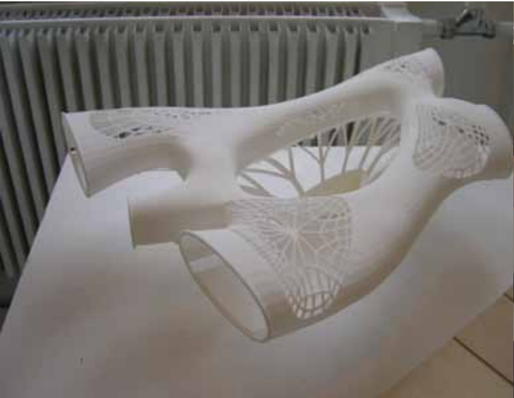
FIG 2.11_Photo by Author, Architects Association, London, UK