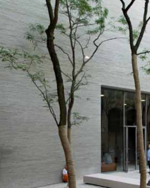
FIG 2.26_ Tactile quality nature adds to textured surface