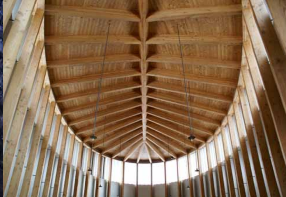
FIG 2.22_Soft filtered light, Saint Benedict Chapel, Sumvitg, Switzerland, Peter Zumthor, 1988