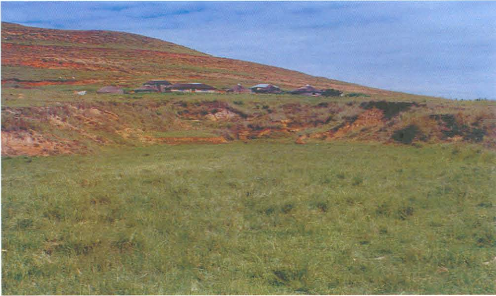
Plate 3. Stabilising gully cutting between hillslope 1 and 2