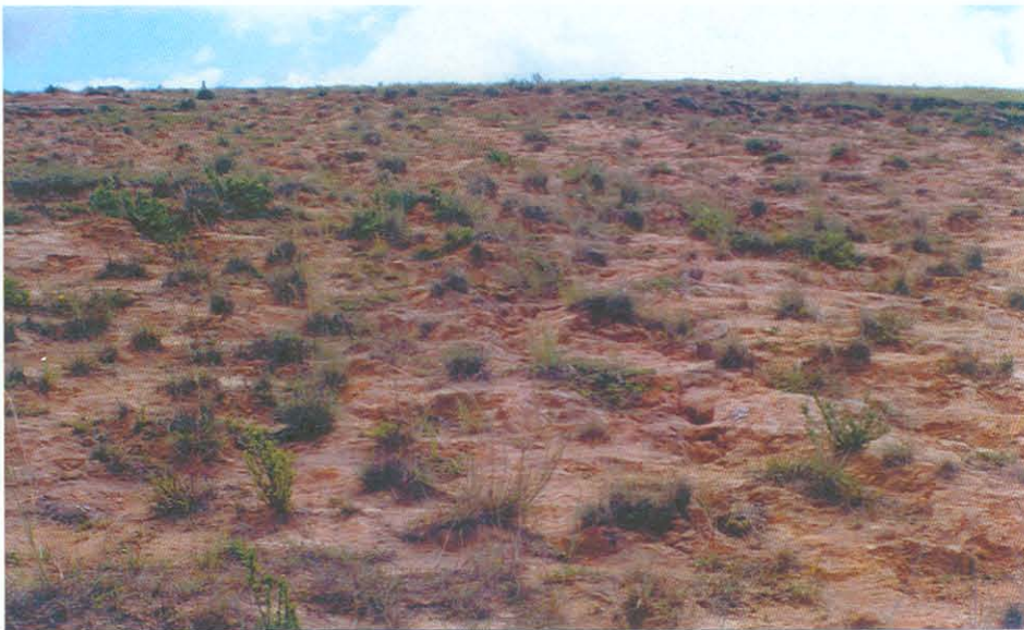
Plate 2. Damage by rill and interrill erosion on hillslope 4