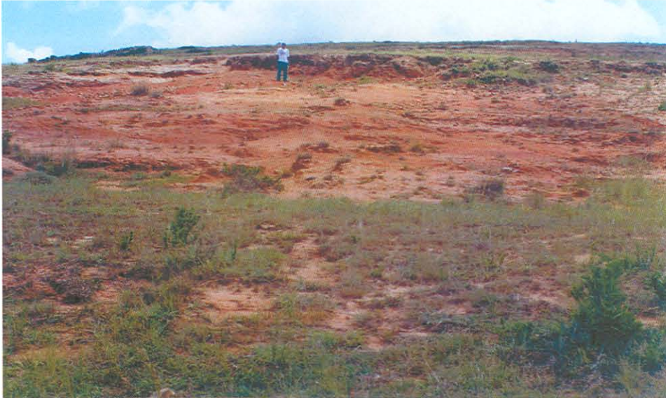
Plate 1. Eroded topsoil by interrill erosion on hillslope 4