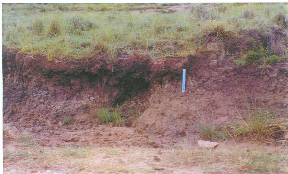
Plate 6. Highly erodible Escourt on hillslope 1