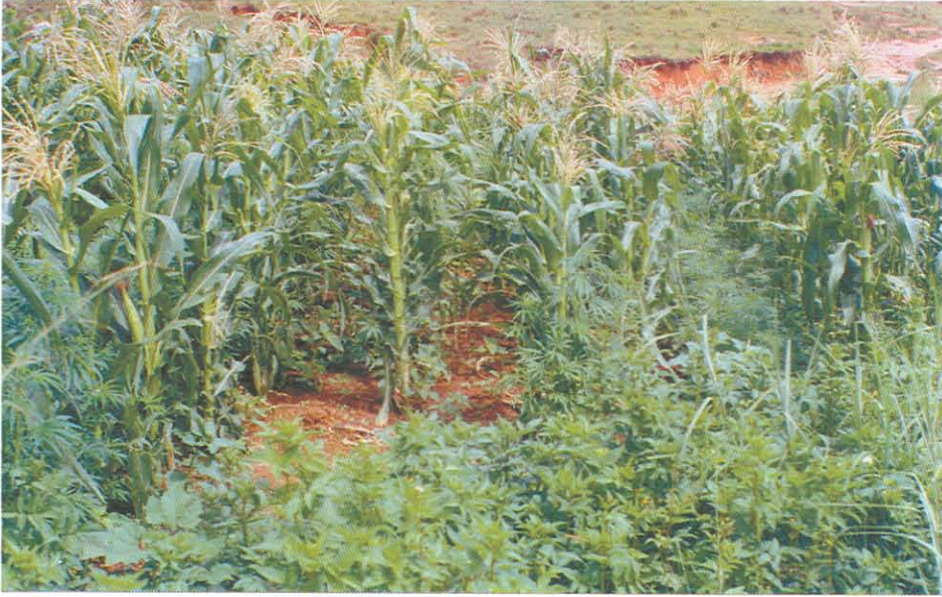
Plate 9. Improved vegetation cover by inter-cropping maize with Canabis Sativa