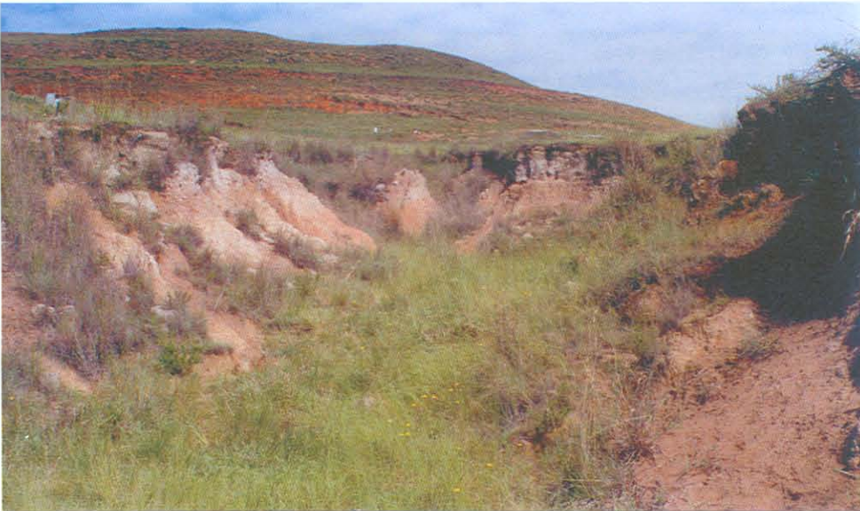
Plate 4. The influence of gully erosion on hillslope 1