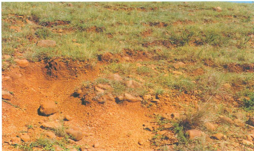
Plate 5. Erosion damage on the rock outcrop area of hillslope 1 and 2