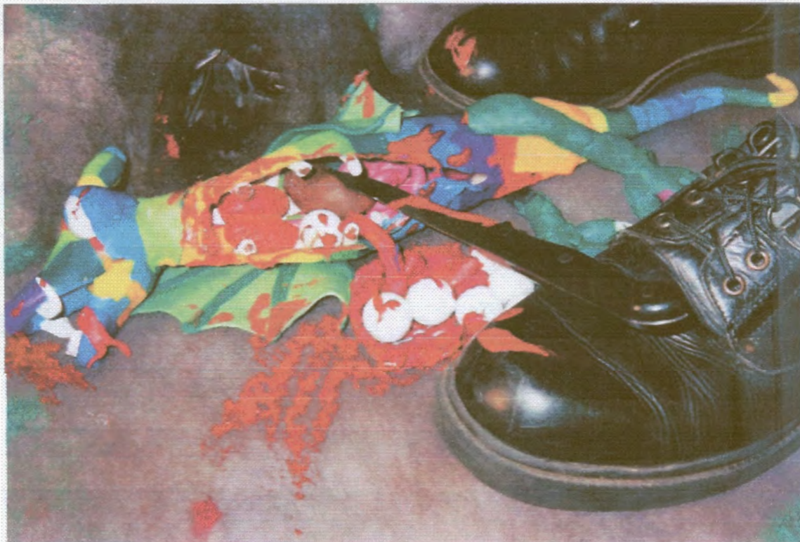
DIE STORIE VAN HEINRICH: CHAOS AANHANGSEL J