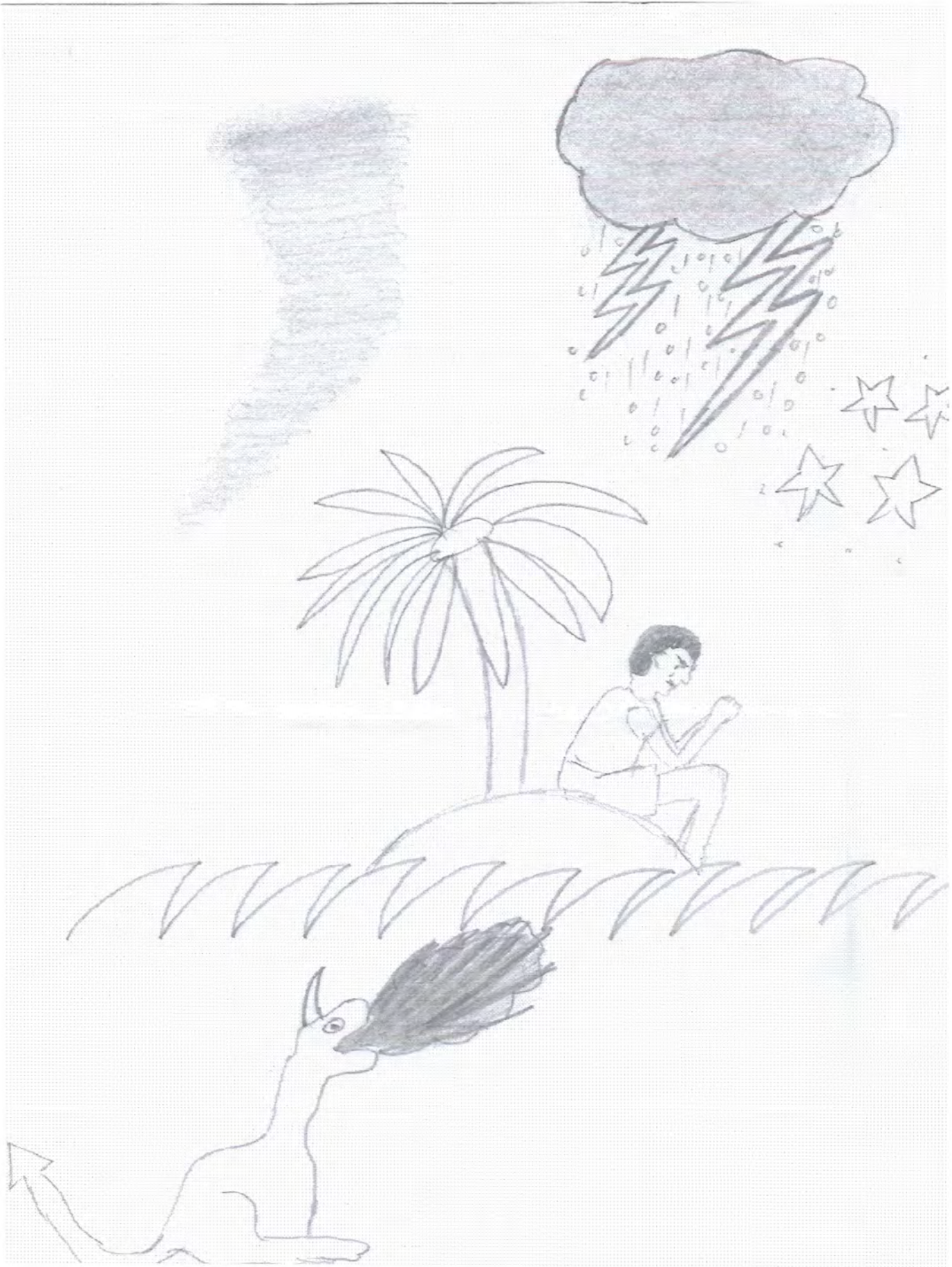
DIE STORIE VAN MARTIE: VERWOESTER AANHANGSEL F