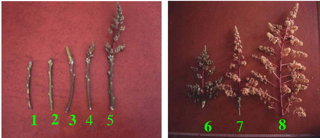
Figure 5.1 Stages of inflorescence development in Mango.

Key: 1: quiescent bud stage, 2: swollen bud, 3: on set of inflorescence axis elongation, 4: apical inflorescence about to sprout, 5-6: opening of individual flowers and branching of the inflorescence, 7: well developed inflorescence, 8: inflorescence about to set fruit