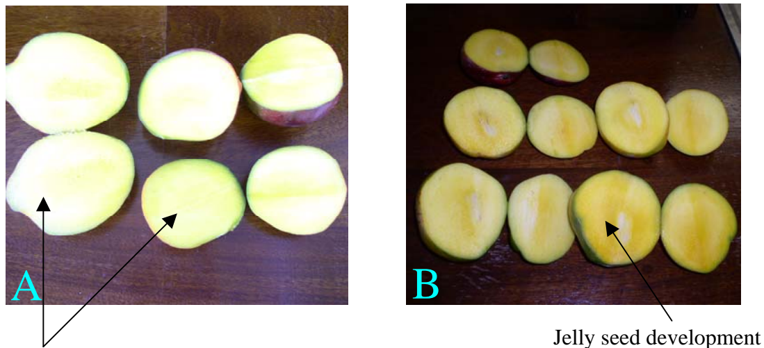
Variability in ripening among different sized fruit

This delay in ripening causes variability in ripening and complicates marketing of the fruit at a given period of time.