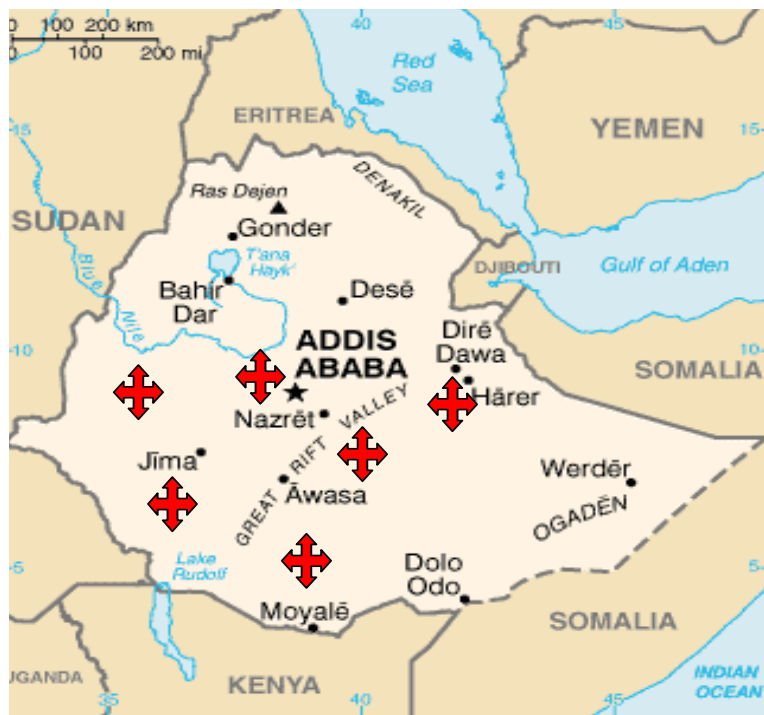
Figure 1.2 Major mango producing areas of Ethiopia (red crosses). (Original map source: http://www.1uptravel.com/worldmaps/ethiopia.html )

very close to the equator is characterized by two erratic and unreliable flowering periods due to bimodal rainy periods and low temperature (main raining season is June-August and the short one is on February-March). This situation exhausts the tree's carbohydrate reserve and usually the yield obtained is below expected, compared to the mango growing areas in the world. Subsequently, the trees usually experience an alternate bearing rhythm. Besides, excessive vegetative growth is a common characteristic of most mango cultivars resulting in unmanageable and large trees, with low fruit retention capacity. Some of the unsolved problems mentioned above, like alternate bearing and poor fruit retention are not confined to Ethiopia, and need to be addressed, particularly to the benefit of South African mango growers.