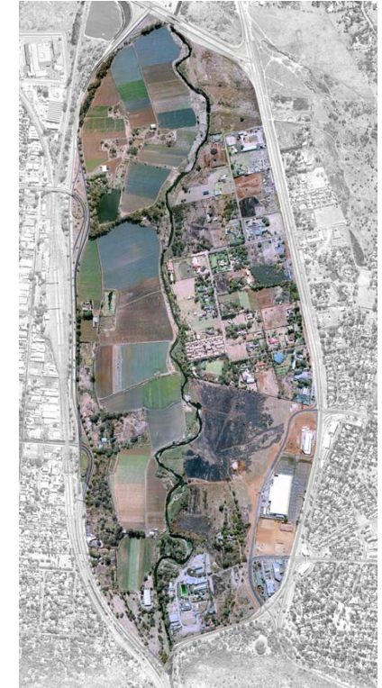
fig 2.1: aerial photo

The site is divided up into private, government / public land. (More in-depth information on the site in chapter 3 – context analyses)