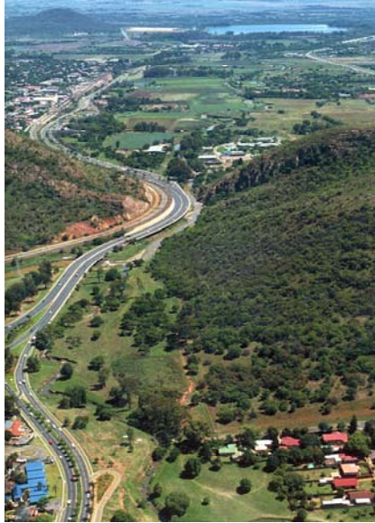
fig 2.2: view to poort (Nel)

Bringing out the green belt that surrounds the river through all the seasons. To provide the buffer between the river and the mix use that frames this green corridor. And lastly giving the land back to itself to change and shape itself as its been doing for so long.