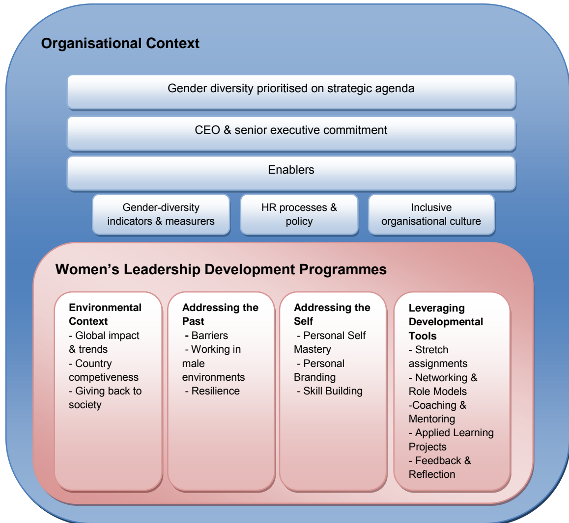
Figure 3: Designing & Positioning Women’s Leadership Development Programmes to achieve Advancement

the design of these programmes for them to address the unique developmental requirement of women into senior positions.