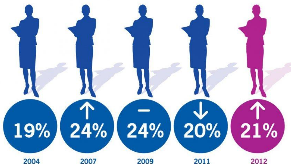
Figure 1: Percentage of women in senior management globally as supplied by Grant Thornton IBR 2012

Women have been entering professional and managerial ranks of business at the same rate as men for decades; even so, they remain under-represented at senior levels (Ely, Ibarra, & Kolb, 2011). A study carried out by Grant Thornton (2012) found that globally, women hold one in five senior management roles, increasing just marginally from levels observed in 2004 (19%). The study confirmed that countries with the highest numbers of women in senior positions include Russia, Botswana, the Philippines and Thailand whilst countries with the lowest representation are Germany, India and Japan. It also established that 34% of businesses worldwide have no women in senior management, roughly the same as the 2009 figure (35%) with women largely employed in finance and human resources roles and less than one in ten businesses being led by a female CEO. Because of this disparity, organisations are implementing various practices and certain economies have responded by implementing quotas on the number of women required on boards (Grant Thornton, 2012).