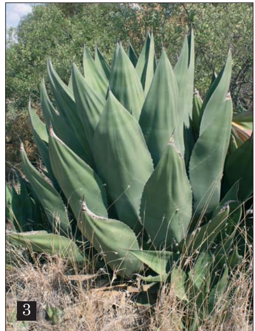
Figure 1. A large clump of A. salmiana var. salmiana where it became established near Redhouse in the Eastern Cape of South Africa. Photo: Gideon F. Smith. Figure 2. Distribution of A. salmiana var. salmiana in the Swartkops River Valley near Redhouse, near the metropolitan city of Port Elizabeth in South Africa's Eastern Cape Province. Figure 3. This specimen of A. salmiana var. salmiana growing near Bloemfontein in South Africa's Free State Province is nearing flowering maturity. The leaves are a dull green colour and remain erect. Photo: Gideon F. Smith.