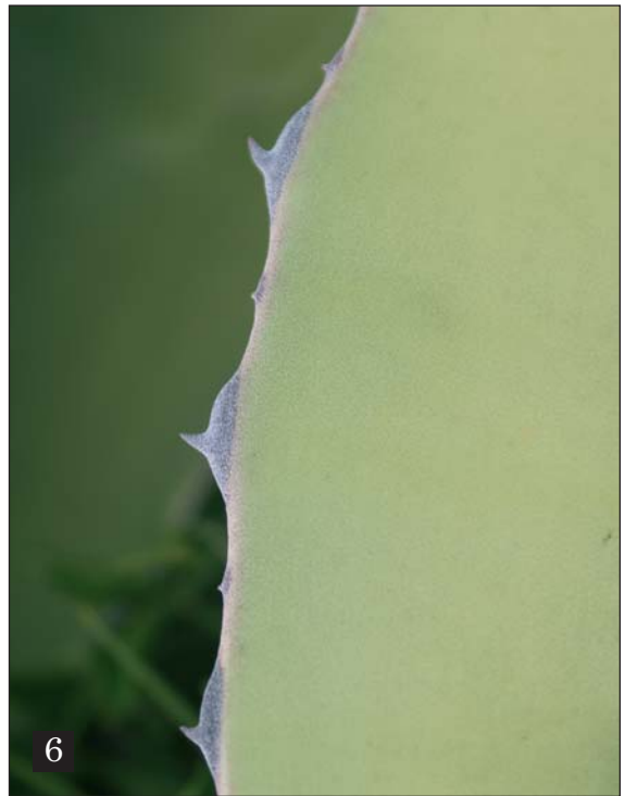
Figure 4. Unlike those of other large-growing Agave species naturalised in South Africa, the leaf tips of Agave salmiana var. salmiana are distinctly valliculate at maturity. Figure 5. The inflorescences of A. salmiana var. salmiana are pyramidal in shape. Figure 6. The marginal leaf teeth of A. salmiana var. salmiana are usually situated on quite prominent mammillae.