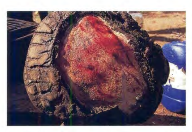
FIG. 2a Ulcerative pododermatitis in an African elephant bull