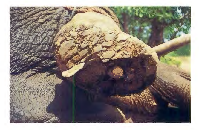
FIG. 2b The complicated hind-foot lesion of case No. 11

and the elastic cartilage cushion. These cavities were filled with moist soil, in addition to the tissue debris and exudate.