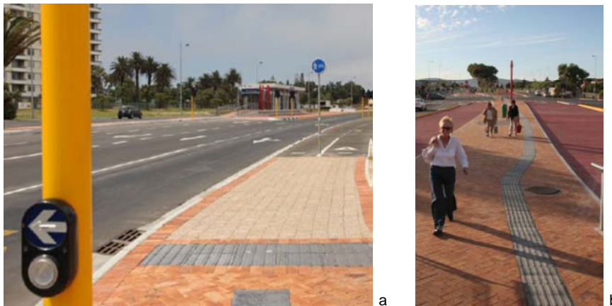
Figures 2a & b: Audible pedestrian push button traffic signals and tactile pavers used for the MyCITI System, Cape Town

pedestrian push-button traffic signals at intersections. Specific attention was given to major pedestrian routes leading to the public transport facilities and the MyCITI stations.