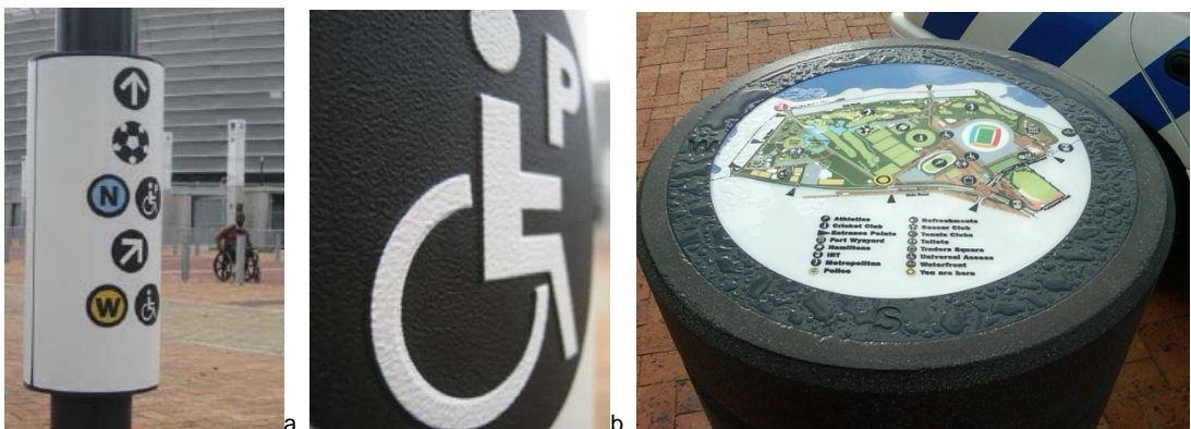
Figures 1a, b & c: Tactile way finding application at Cape Town Stadium

The tactile way finding implemented at Cape Town Stadium Precinct provides directional information to the various areas in the immediate vicinity of the Stadium such as parking areas and the various entrances to the Stadium. This way finding concept was also introduced on the podium levels of the Stadium. The tactile information maps applied to bollards with the Green Point Urban Park guide people with visual impairments through this demarcated environment around the Stadium. The design details of these directional signs and information maps are equally accessible to sighted users, due to the use of internationally recognisable symbols rather than tactile language or signs targeted at the sight impaired only. The use of international symbols also reduces language barriers often associated with written signage.