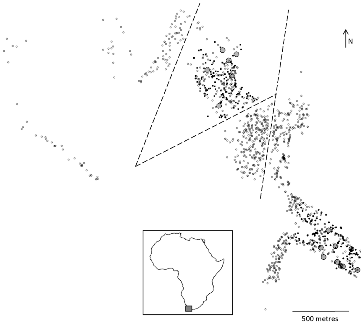
Figure 1. Map of B. suillus individuals sampled. The south-eastern study area is Region 1 showing study females (filled grey circles, solid lines) and potential sires (black diamonds). Region 2 is the northern study area showing study females (filled grey circles, dashed lines) and potential sires (black squares). Tarred runways and access roads representing potential barriers to subterranean movement are represented by dashed lines. Sampled individuals not genotyped are also shown (small unfilled circles). doi:10.1371/journal.pone.0039866.g001

containing three or more progeny were also compiled as a third means by which to estimate multiple paternity.