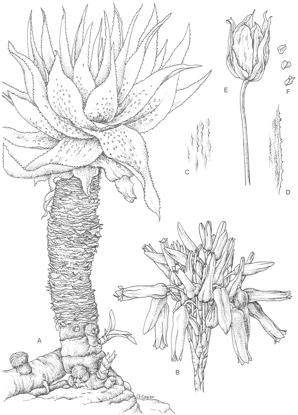
FIGURE 34.— Aloe neilcrouchii , Crouch & Johnson 1247 (PRE). A, plant, \times 0.33 ; B, inflorescence, \times 0.66 ; C, tuberculate leaf surface, \times 1 ; D, leaf margin, \times 1 ; E, fruit capsule, \times 1 ; F, seeds, \times 1 . Artist: G. Condy.