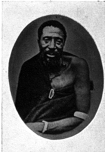
Sarili, Head of Gcaleka Clans and Paramount Chief of Ama-Xosa