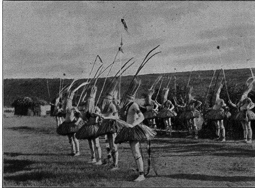
The man-making Custom—" Abakweta " Dance.