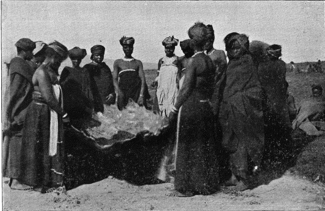
Xosa Women as musical drummers in "Abakweta" dance.