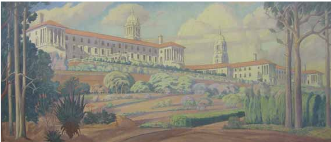
17 J.H. Pierneef, Union Buildings . Oil on hardboard, 100 x 200 cm. Signed r.b. Pierneef. Pretoria Art Museum. This painting was commissioned by the City Council of Pretoria for the Union Castle ship "Pretoria Castle" in 1938. Since it was a public commission, Pierneef had to comply with the wishes of the selection committee and therefore the work is mainly decorative.

The last work, entitled Apiesrivier, Pretoria met Meintjeskop agter (Apies River, Pretoria with Meintjeskop behind) was created in 1948 and is in the Pretoria Art Museum. This work, painted in the year that the Nationalist Government came to power, once more shows Meintjeskop without the politically unacceptable Union Buildings and is again titled after the insignificant Apies River. This oil shows the winding river running in a gully