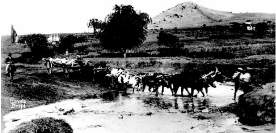
1 Photograph of Van der Hove's Drift in 1890. (National Archives Repository, Pretoria: SAB 1131). This drift in the Apies River was well known to Pierneef. Note the barren Meintjeskop hill in the background.