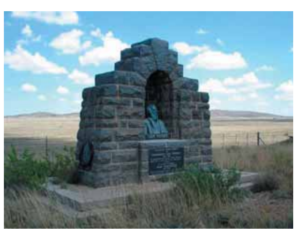
Figure 4 Louw Wepener memorial, Bethulie District (Clarke: 2008).

A bronze bow-topped bas relief plaque matching the niche containing the life-size bronze bust in front, both sculpted by Coert Steynberg (1905-1982), depicts the assault on Thaba Bosigo with the inscription 'Getrou tot in die dood'<sup>13</sup>. A second cast of the bust is to be found in the town of Wepener in the eastern Free State, erected in 1965, the shoulders and full chest omitted from its casting, the bust mounted on boulders removed from a site at Thaba Bosigo proximate to where Wepener was first buried (Geyser, 1989: 82-3).