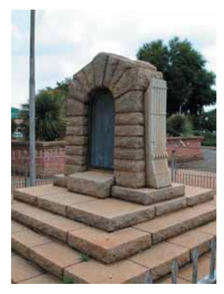
Figure 5 Voortrekker centenary monument, Middelburg, Mpumalanga. (Clarke: 2008).

the petition requesting their husbands to lay down their arms. The moment depicted on the grave is when Mrs de Wet with the women watching tears apart the document in scorn saying "Sal ons die Burgers vra om oor te gee? Nee, nooit!" [Will we request the Burgers to admit defeat? No, never!]<sup>17</sup>, words recorded on the end of the grave. Architecturally, the grave is of the simplest, a rectangular form of a single coursing of rough-hewn ashlar blocks to create the niches for the bronze panel and inscriptions.