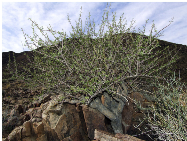
Fig. 1. Commiphora buruxa in its natural habitat, 1.8 m tall.

Commiphora buruxa is probably most closely related to C. cervifolia , with which it shares a similar habit, non-peeling