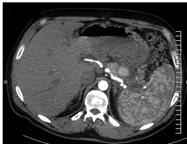
Figure 1. Contrast-enhanced CT-scan demonstrating a pseudoaneurysm in close proximity to the splenic artery.

puncture the pseudoaneurysm, which was followed by injection of a total of 7 mL of a thrombin-collagen compound (D-stat; Vascular Solutions Inc, Minneapolis, MN). Color Doppler confirmed the complete obliteration of the lesion (Fig. 3).