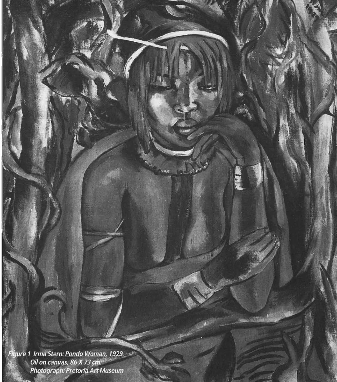
Figure 1 Irma Stern: Pondo Woman, 1929. Oil on canvas, 86 X 73 cm.