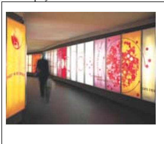
Figure 5: Red Zone pedestrian tunnel

in Somali Chinese Bengali and English within the artwork. A competition was held to involve local artists and we worked with people from these backgrounds who in turn worked with local communities. Monitoring research showed that the number of people accessing the shops from the tunnels went up at completion of the project.