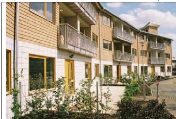
Figure 1: Boatemah walk

We have been working with residents over a five-year period, to develop proposals at Angell Town, Brixton, now transformed by an estate action programme. Boatemah Walk is the third phase of work; new build designed by ATAP, after Holles House and Warwick House, refurbishment projects.