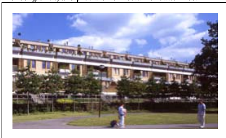
Figure 6: Landscaping across the park to the refurbished Angell Town flats with pleached limes