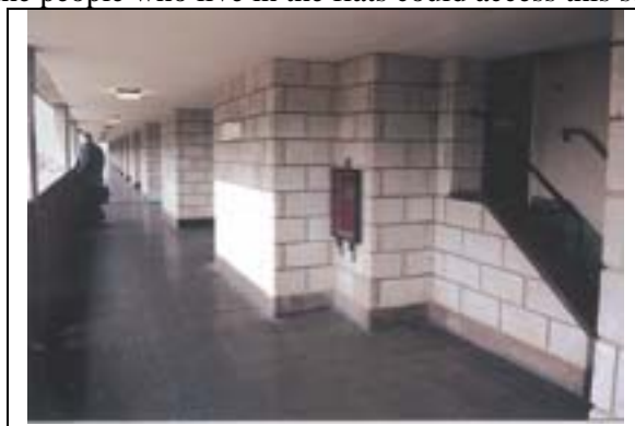
Figure 7: The original dark alleys and stairways at Angell Town

We incorporated the space where the stairways had been, into the flats to make them larger and also put windows from the flats to overlook the pedestrian walkway. We added security doors with an entry system so that only the people who live in the flats could access this semi-private area.