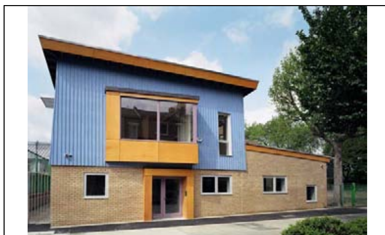
Figure 3: Coningham Children's centre

minimum wheel chair access to the home and to washing and toilet facilities. But women also need to be supported in the very demanding role as carers this can be done by providing respite for the people they care for from as little as one night to a few weeks. There are two fold benefits; enabling the person with disabilities to get out of the house and refueling carers who are often on call 24 hours a day in circumstances which would not be tolerated in a male dominated work environment. Again if it is to work successfully location is very important.