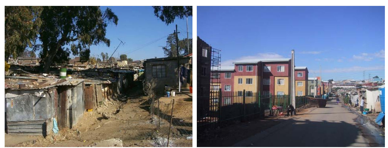
Figure 6: Improving living conditions by providing medium density housing

At a strategic level, planning approaches could be adopted by local government to actively encourage the reduction of vacant land, 24-hour land use, the pedestrian use of infrastructure, equitable provision of facilities and amenities etc. This could be supported by more detailed CPTED guidelines aimed at guiding the design of the physical development at local level. Figures 6 to 9 illustrate how CPTED could be incorporated into initiatives aimed at improving the quality of human settlements.