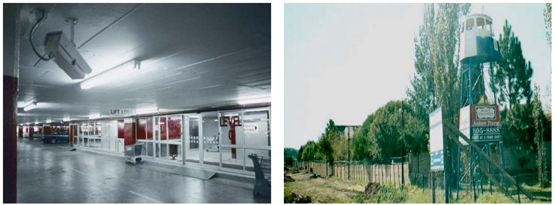
Figure 1: The glass lobby increases visibility and the watch tower ensures better lines of sight

Maximise opportunities for observance of public and private areas either by users or residents during the course of their normal activities (passive surveillance) or by police or other security personnel (active surveillance). Ensure that environments are made visible through effective lighting and uninterrupted lines of sight.