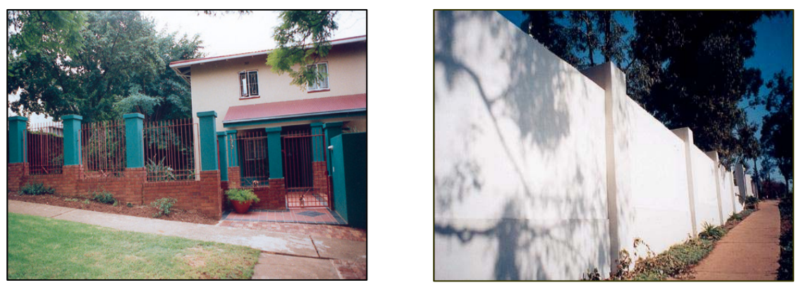
Figure 5: A fence as target hardening measure allows for better surveillance than a solid wall

Reduce the attractiveness or vulnerability of potential targets by, for instance, physically strengthening it or installing mechanisms that will increase the effort required to commit an offence.