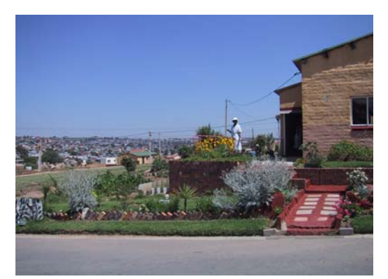
Figure 4: "Crime and grime" image versus a clean, positive environment