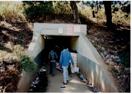
Figure 3: Green belt: easy access and escape routes; subway: no escape routes for victims