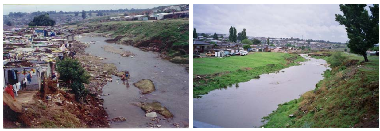
Figure 9: Improving living conditions and the quality of the environment