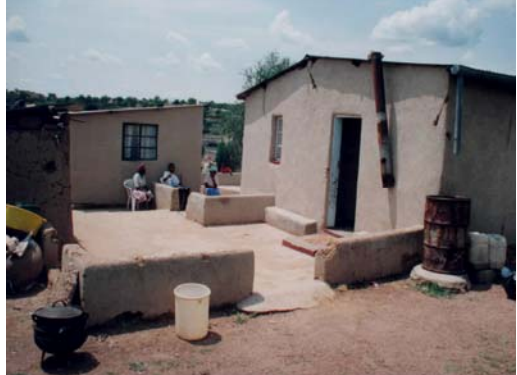
Figure 2: Examples of people taking ownership of public space