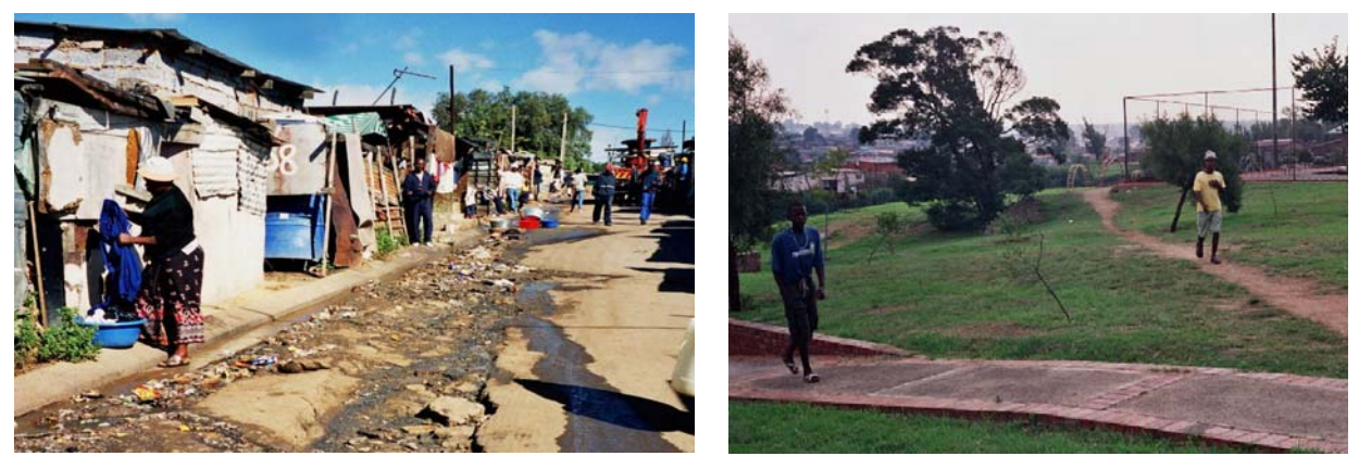
Figure 8: Improving infrastructure to make it more pedestrian friendly