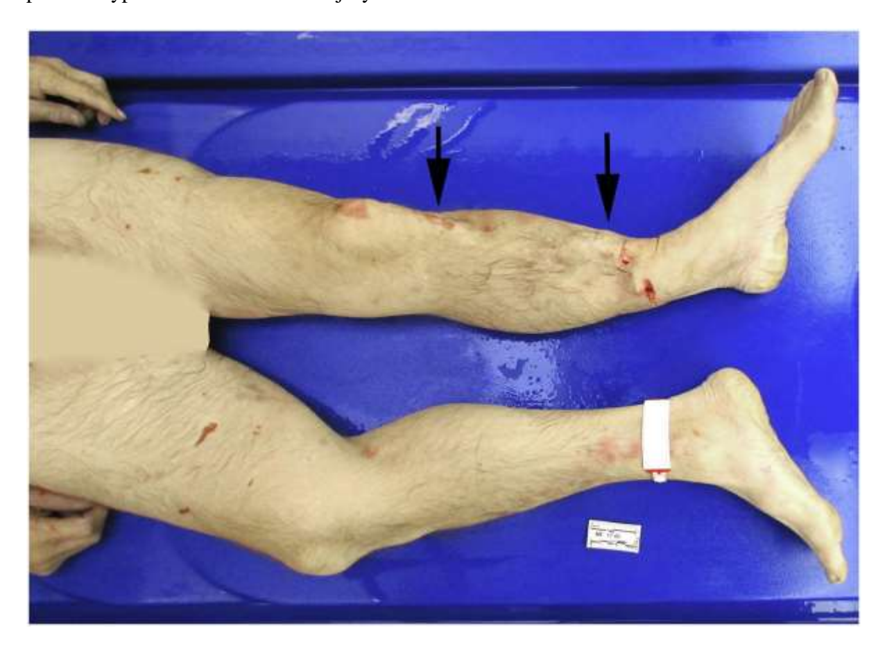
Fig. 2. Lower limbs of the victim of a pedestrian vehicle accident, Note the bruising and lacerations. Disruptions on the lower left leg (arrows) indicate how the leg likely wrapped around the bumper of the police car. Notice how the right leg also has bruising, but is not deformed except for the lateral rotation of the whole leg. An indication of the proximal femur dislocation and/or a fracture.

drawing the whole leg up toward the hip. Additionally, the right lower limb probably avoided the destructive characteristics of the left leg because it was non-weight bearing, which allowed it to survive the impact without fractures. All of these features on the body, which are observed during autopsy, provide prior knowledge, in the form of soft tissue, as to the possible type and location of the injury.