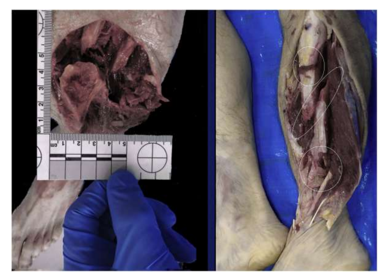
Figure 3. Complex fractures associated with blunt force injury in the proximal left tibia and distal third of the left tibia and fibula. The left image is the initial examination with the knee flexed in autopsy and the skin laceration retracted revealing the complexity of the wound. The right image exposes the length of the left tibia and fibula as the skin is incised and retracted to reveal complex fractures (ovals). Notice bruising on medial left ankle, right image.

fractures (Fig. 3). At this point, an anthropologist's diagnosis of bending direction of bone is difficult at best, due to the dishevelled mix of tissues and fluids. Further analysis requires incision and debridement of the soft from the hard tissue, with eventual removal of the left tibia and fibula. Macerated and processed bone is much easier to evaluate fracture characteristics associated with modes of failure (tension, compression and shear) which can assist an anthropologist in interpreting the bending direction of a bone.