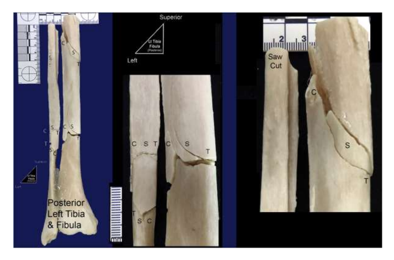
Fig. 4. Three images of the left posterior lower leg with proximal and distal bone fractures (left image with proximal bone removed in autopsy). The upper leg (right image) reveals the reconstructed tibia and the lower fractures (middle image) show the reconstructed tibia and fibula. The upper tibia fracture is approximately 10 cm above the paired fractures distally, and present with similar fracture mechanisms (labelled tension T, shear S, and compression C). The middle insert demonstrates a close –up of the distal third fracture patterns with labelling revealing areas of fracture characteristics associated with compression (C), shear (S), and tension (T) modes of failure.

Fracture characteristics observed in crack development of a bone (as described above in Fig. 1) can assist a forensic anthropologist in identifying the modes of failure which can be further used to determine 1) the direction in which the bone bends, 2) the weak points (stress risers) in the tubular bone shafts and, with prior knowledge, the POI [32]. As long bones vary in shape and size, all bones present with different stress risers (weakness) and stress resistors (strengths) which, combine with a variety of external loading conditions that create distinct fracture morphology. The variation may or may not represent the 2-dimensional distinct