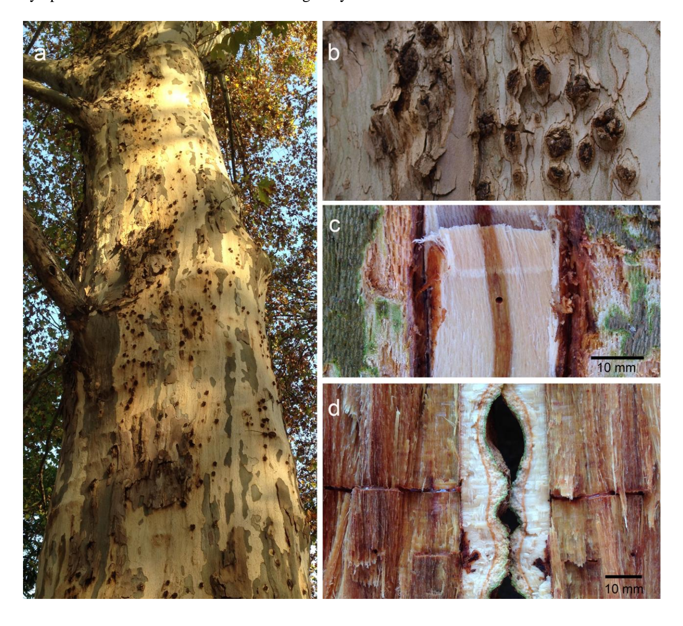
Figure 1. a-b. external symptoms of polyphagous shot hole borer attack on Platanus x acerifolia ; c. removal of bark and cambial tissue exposing symptoms caused by fungal colonisation associated with beetle entry hole; d. longitudinal section through branch showing internal symptoms of discolouration around beetle gallery.